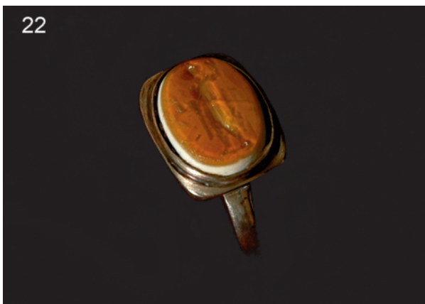
Fig. 22 Silver ring made by Edith Morris, set with antique seal stone (early 1950s). Otago Museum Collections F54.150.