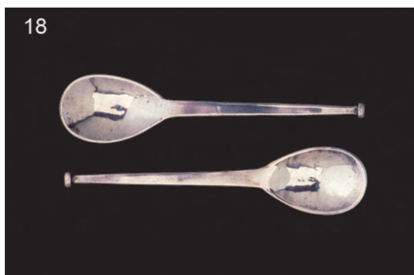
Fig. 18 Silver spoons made by Edith Morris (early 1950s). Otago Museum Collections F54.30-31.