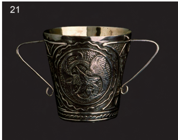
Fig. 21 Loving cup with gilded interior made by Edith Morris (late 1950s). She wrote to Charles Brasch (8 December 1958): ‘Unlike jewellery, there is no demand for loving cups’. Otago Museum Collections F2000.28.