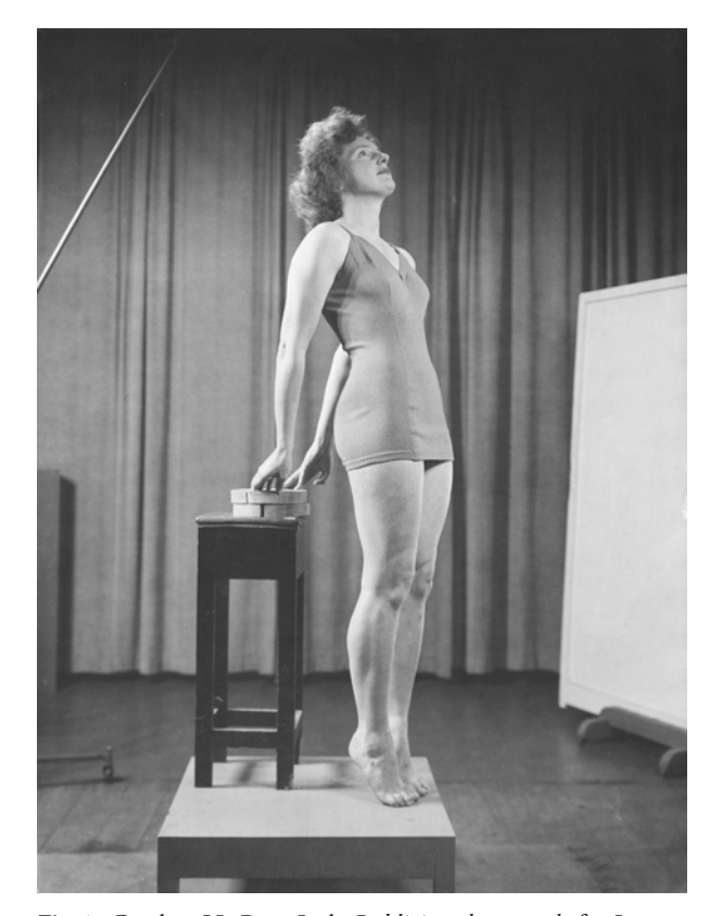
Fig. 9 Gordon H. Burt Ltd: Publicity photograph for Jantzen swimwear (1932–33). Gelatin silver glass negative, 215×165 mm (Te Papa C.2281).

The explosion of interest in exploring a distinctively New Zealand identity in the 1950s and 1960s, as New Zealand history began to be taught in universities and books such as Keith Sinclair's 1959 landmark A history of New Zealand became bestsellers, soon ended any notion of 'meantime' for history at the Museum though, and the first historian was appointed in 1968. A corresponding interest grew in New Zealand's historical photographs. Dick Scott's 1962 book Inheritors of a dream: a pictorial history of New Zealand broke new ground with its extensive use of such images, and in 1970 a group of photographers formed PhotoForum Inc. to promote historical and expressive photography. They published an influential magazine indicatively titled Photographic Art and History, which later became New Zealand Photography and then PhotoForum. One of the prime movers behind PhotoForum was the Dominion Museum's own photographer, John B. Turner (1967-71), and he was also the organiser of the first major survey of historical New Zealand photography to that time. This was the 1970 touring exhibition for the Govett-Brewster Art Gallery, titled simply 'Nineteenth century New Zealand photography'. The exhibition was shown at the Museum in 1971, and other temporary historical photography exhibitions displayed there, such as 'Gaslight on muddy streets' (1968) and