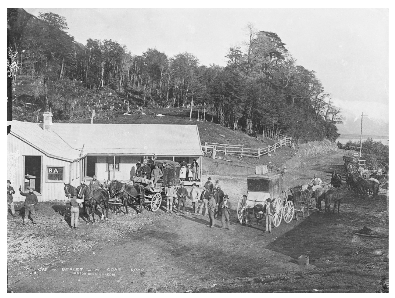
Fig. 4 Burton Brothers: Bealey, West Coast Road (c.1880). Collodion silver glass negative, 165×215 mm (Te Papa C.15380).

Ulyatt noted inside the cover that by his count 3231 of these were now missing, leaving just a sorry 5189. A persistent rumour within the Museum over several decades was that a Museum photographer destroyed (or disposed of) many negatives during the early 1950s to create more storage space. This is possibly supported by a statement in the annual report of 1955–56, which notes that: 'In order to reduce the amount of space required for storing the larger glass negatives, more of these have been copied to a smaller size and replaced' (National Art Gallery and Dominion Museum 1956: 17).