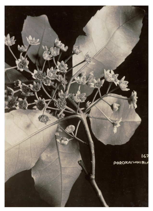
Fig. 5 William C. Davies?: Porokaiwhiri (Hedycarya arborea) (c.1920-c.1945). Gelatin silver print, 151 \times 109 mm (Te Papa, not registered).

slides, ranging from 1908 on the Kermadec Islands through to 1953, both collected and museum photographs.