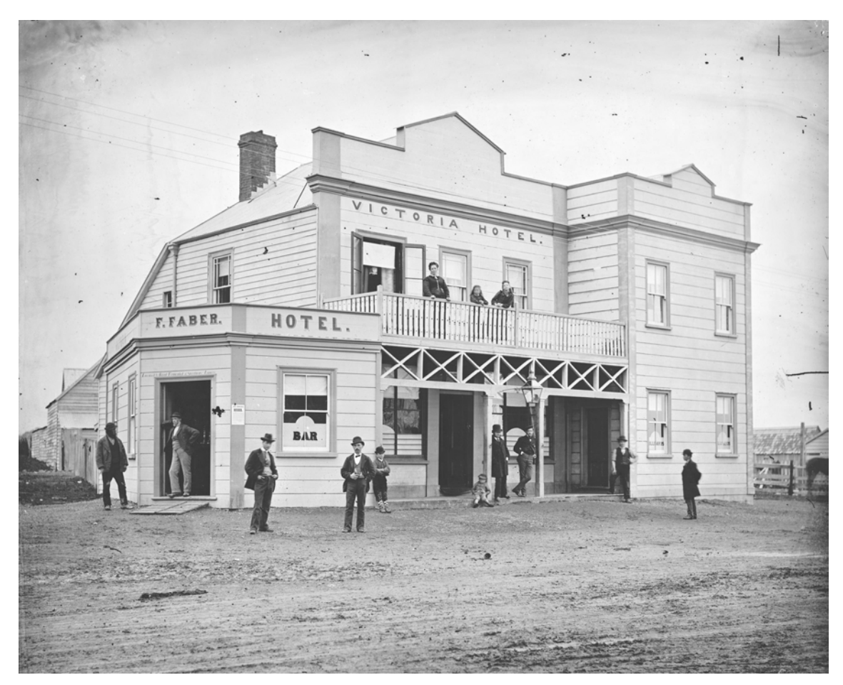
Fig. 12 James Bragge: Victoria Hotel (c.1875). Collodion silver glass negative, 255 × 305 mm (Te Papa D.32).

nationwide concern about photographic preservation generally had reached the point that a strongly attended three-day symposium organised by the Archives and Records Association of New Zealand was held on the subject at the Museum. And in the same year, Pictures, a feature film on the Burton Brothers, suggested in its credits that the Burton negatives were not well cared for. The film catalysed 20 years of agitation, and in 1985 a large government grant was made towards a rehousing, cataloguing and duplication project for the Burton Brothers negatives, marking the first official recognition that the photography collection had been neglected and was in need of urgent care. By the time Te Papa was formed in 1992, it was fully recognised that it was no longer desirable for photographers in a service department to be caring for collection items, and a separation was made between photographic services, collection management and photo library.