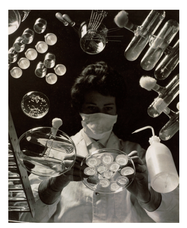
Fig. 16 Steve Rumsey: Tissue culture (1957). Gelatin silver print, 508×405 mm (Te Papa O.27055).

as a whole. Aside from the single Westra acquisition, to this point the collection consisted mostly of negatives. The Knight and Main additions significantly increased the number and variety of prints and albums, adding 154 albums alone to a previously existing holding of 98.