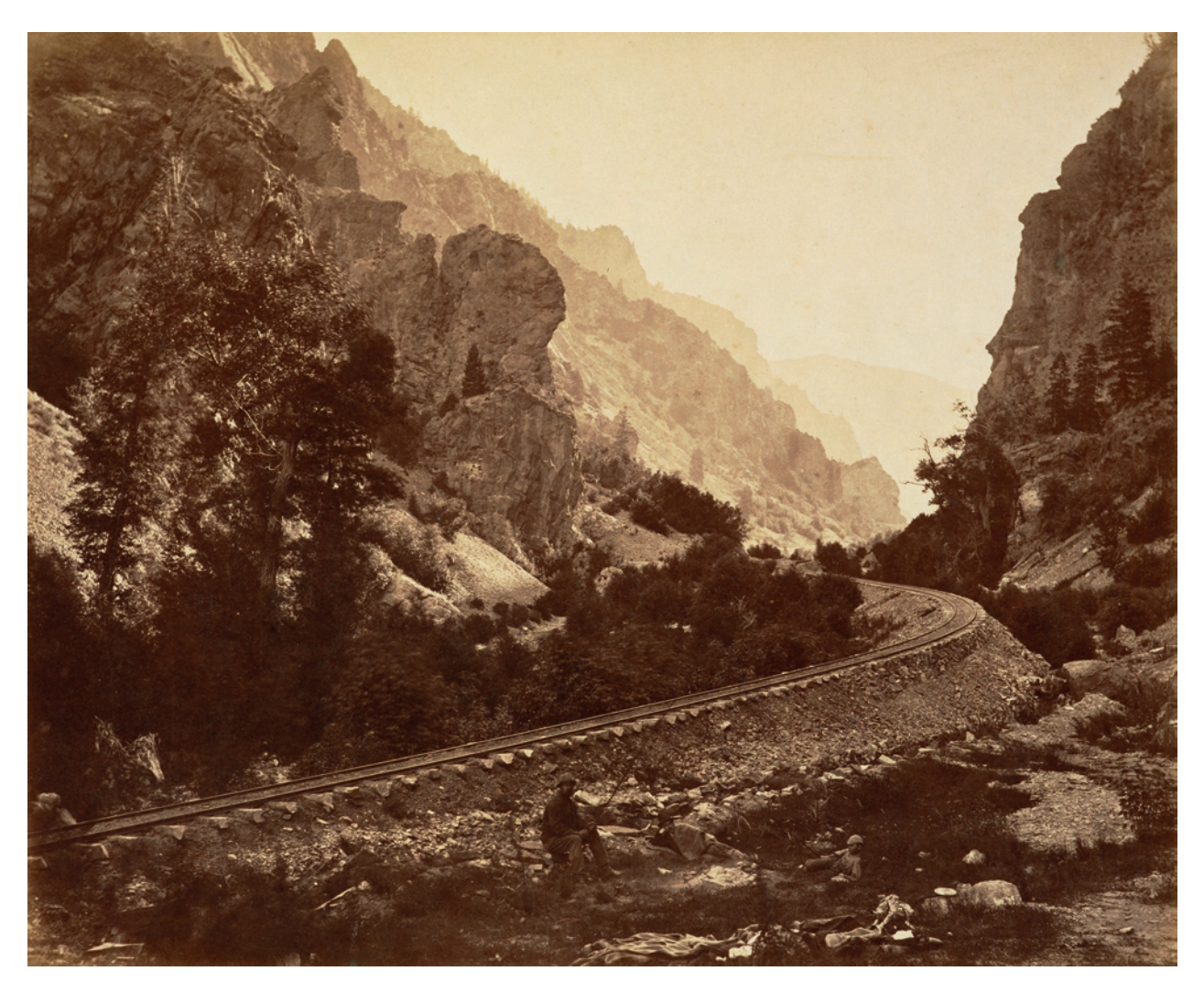
Fig. 1 William Henry Jackson: American Fork, Utah (c.1869-71). Albumen silver print, 201×250 mm (Te Papa O.5904).

these various exhibitions, it is tempting to think that some of the photographs might have come back to the Colonial Museum, especially if they were purchased by the colonial government in the first place. However, this is difficult to verify. While each exhibition has a catalogue listing of exhibited photographs, few, if any, can be cross-referenced to the Colonial Museum's lists of acquisitions, or be found in Te Papa today. This may be because many items were not necessarily purchased by central government for supplying the exhibitions, and even if they were, some were sold or gifted locally at the end of the exhibitions and others may have found an alternative home back in New Zealand besides the Colonial Museum, such as the General Assembly Library.<sup>4</sup> One definite case where work from an exhibition came to the Colonial Museum is that of four framed photographs by the Burton Brothers and 16 large prints by Josiah