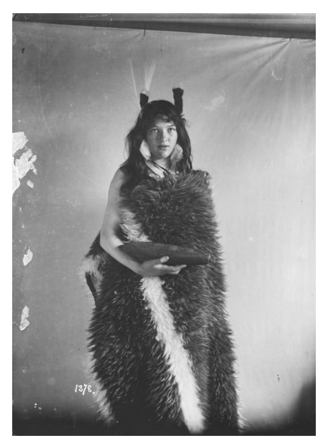
Fig. 2 Augustus Hamilton: [Portrait of an unknown Māori girl] (1903–13). Gelatin silver glass negative, 165×115 mm (Te Papa MA_B.1975.

Some of the most interesting photographs that were made with ethnographic intent were those produced by James McDonald on field expeditions (Fig. 3). McDonald had a background that included photography (and later filmmaking) for the Department of Tourist and Health Resorts, and was employed briefly by the Museum from 1905 to