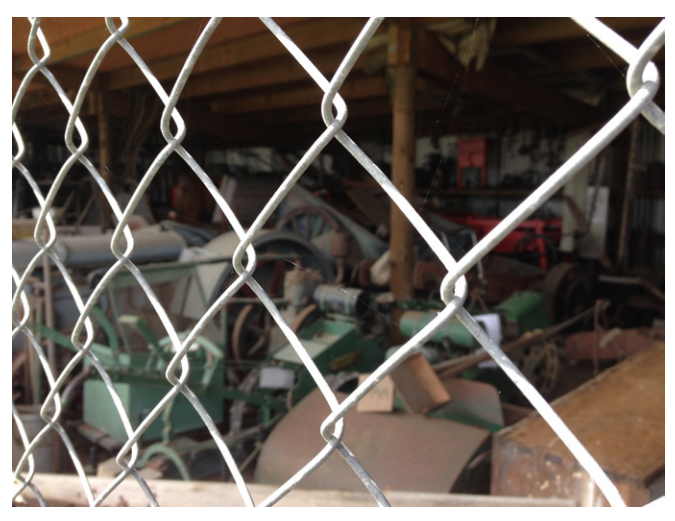
Machinery or items from another region may be out of scope of your collection policy.

Your collection policy might be quite specific about certain objects, for example, stating that large machines from outside your museum's region will not be collected.