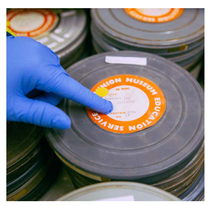
There is a strong presumption against deaccessioning so consideration needs to be thorough and well documented.

Museum Code of Ethics (MA and ICOM) state there is a strong presumption against deaccessioning so consideration needs to be thorough and well documented. Deaccessioning need not be controversial if transparent and ethical practices are followed. (see risks below)