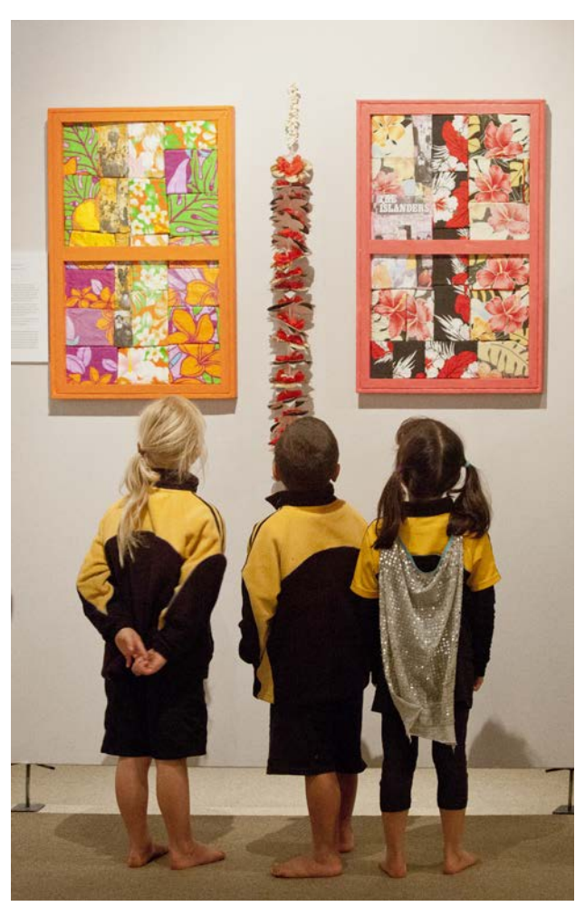
The To Be Pacific exhibition.

Showing a broadcast (and any sound recording or film included in it) or a cable programme as part of an exhibition does not infringe copyright if no admission fee is charged. Some public performances are protected by copyright. You need to be satisfied that copyright approval has been obtained before performances are given or recorded.