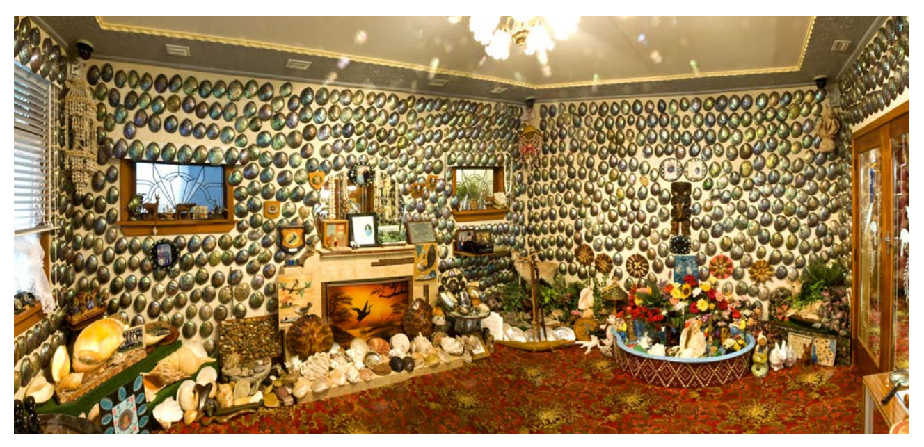
Inside the Paua Shell House exhibition.

This document is licensed under a Creative Commons Attribution 3.0 New Zealand licence. For more information about the uses of the licence visit http://creativecommons.org/licenses/by/3.0/nz/