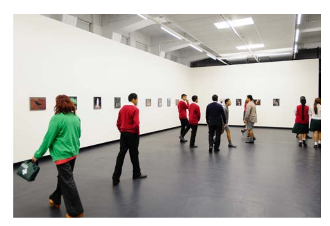
Students from Bishop Viard College in Viviane Sassen: Lexicon, City Gallery Wellington.