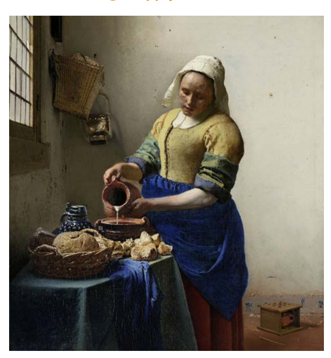
The Milkmaid, Johannes Vermeer, c. 1660, The Rijksmuseum, Object number SK-A-2344.

Most museums do not own the copyright in the collection items they own. However, museums can choose to control photographic access to collection items and control use of images of collection items via contract. If a contract is in place, those wishing to use images of a collection item can be required to obtain the image from the museum and pay a fee to use images of collection items, whether or not the image is in copyright or copyright is owned by other parties.