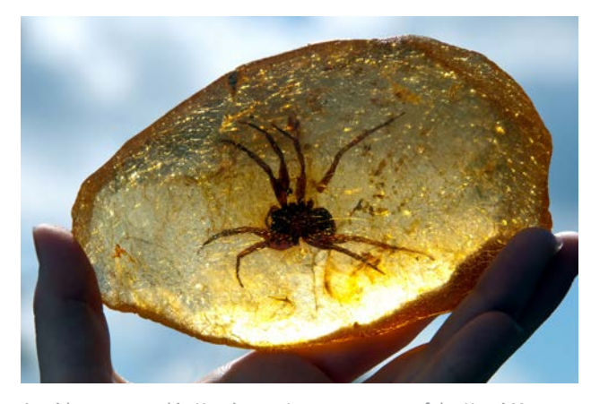
A spider preserved in Kauri gum.

Once images and text are published on the Internet they become more accessible and findable. Greater accessibility often leads to increased interest in reuse and sharing by the public. Consider how your institution can make reuse and sharing easier. How will your institution manage the custodial responsibility to protect copyright owners' interests? Consider negotiating a licence with copyright holders that permits sharing. Consider when you will approach a copyright infringer to request takedown or destruction of the unauthorised copy. At what point will you consider legal action? See the section on Museums Online on page 14, as well as the copyright manual, for further guidance in this area.