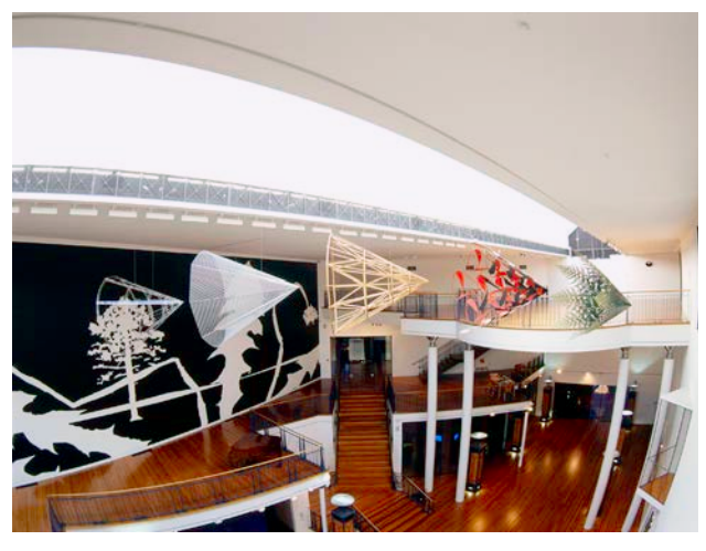
Dunedin Public Art Gallery foyer.

There are also visual art collecting agencies that may help (for example, Viscopy).