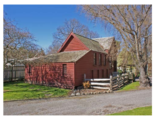
The Donald Woolshed (1858) at Cobblestones Museum, Greytown.

Museums often do not own the copyright for most copyright works in their collections. Therefore, permission must be obtained from the copyright owner before these works are copied. Museums also have a custodial responsibility to protect the copyright owner's interest in the works they hold.