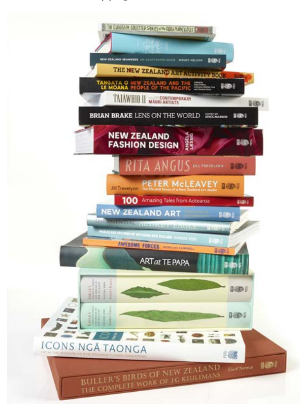
Te Papa Press, New Zealand's unique museum publisher.

Other copyright images supplied to the public, such as photographs, should be accompanied by an assertion of the museum's copyright.