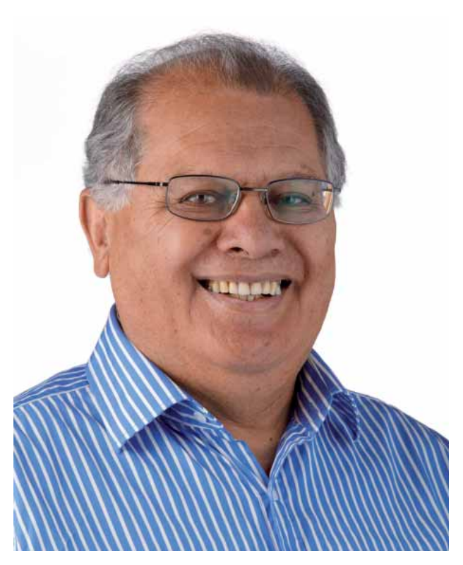
Wira Gardiner, Chair Museum of New Zealand Te Papa Tongarewa, Wellington