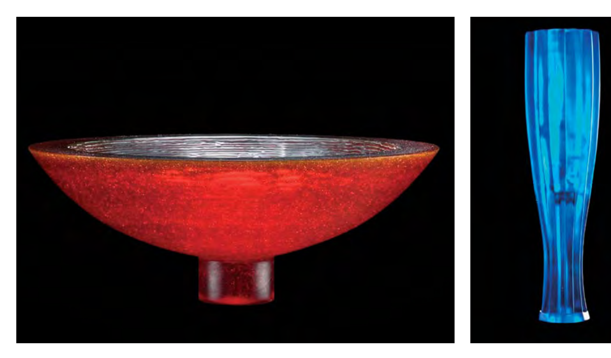
Fig. 1 Ann Robinson Large Wide Bowl (photo by Norm Heke). Fig. 2 Ann Robinson Cactus Vessel – blue (photo by Norm Heke).

KEYWORDS: Securing fragile objects, exhibitions, earthquake mitigation, Museum Wax^M, test.