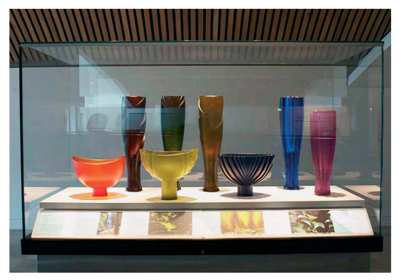
Fig. 6 Cactus Vessel – blue and Cactus Vessel – neodymium as displayed alongside other works in Pacific Rim: Ann Robinson's glass (photo by Norm Heke).

compared to Museum Wax<sup>TM</sup>. The decision to use any wax for earthquake mitigation needs to be made after careful consideration of the strength, porosity and suitability of the object to be secured. It must be remembered that for effective protection from earthquake damage, consideration must also be given to the design and stability of the furniture used in the exhibition.