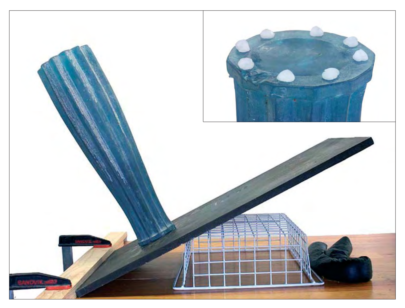
Fig. 3 (inset) Utility Wax applied to the base of a test vase (photo by Norm Heke). Fig. 4 Set-up of vase for test (photo by Norm Heke).

(Anonymous 2001: 1). The Utility Wax used was white. An investigation into the identity and possible negative effects of the stabilisers was outside the scope of this project.