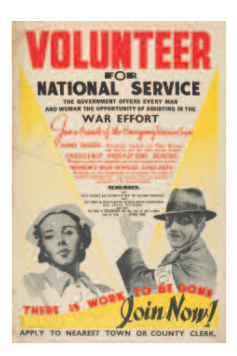
Fig. 11 Poster, 'Volunteer For National Service', October 1940 (artist unknown; printed by E.V. Paul, Government Printer, for the National Service Department, Wellington. Two-colour block-printed text with halftone photolithographic image on paper, 760 x 505 mm. Gift of Mr C.H. Andrews, 1967. GH014036, Te Papa).