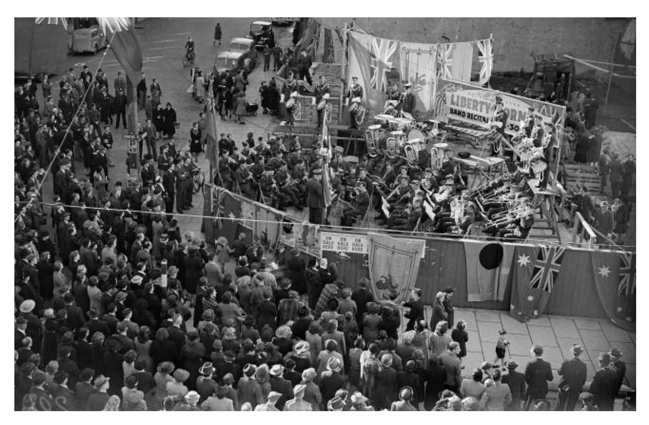
Fig. 19 Aerial view of Liberty Corner at the corner of Hunter and Featherston streets, Wellington, 18 May 1942. 'Guard Their Liberty' posters decorate the front of the stage as the Air Force band entertains the crowd.

matter requires a period of from five to six weeks' ('Report of Working Committee', 18 May 1943, p. 1, T 1, 44/210, ANZ). They had just enough time.