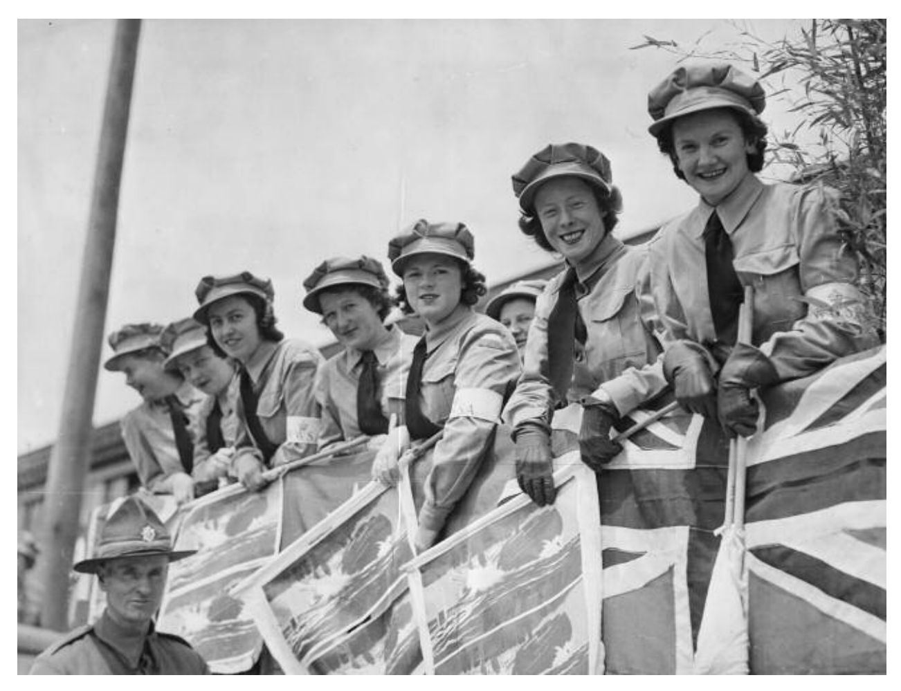
Fig. 6 'Don't Talk Campaign', Auckland, November 1941. Women's War Service Auxiliary members are seen here standing on a lorry holding multiple copies of the 'Lest We Regret' poster on poles.