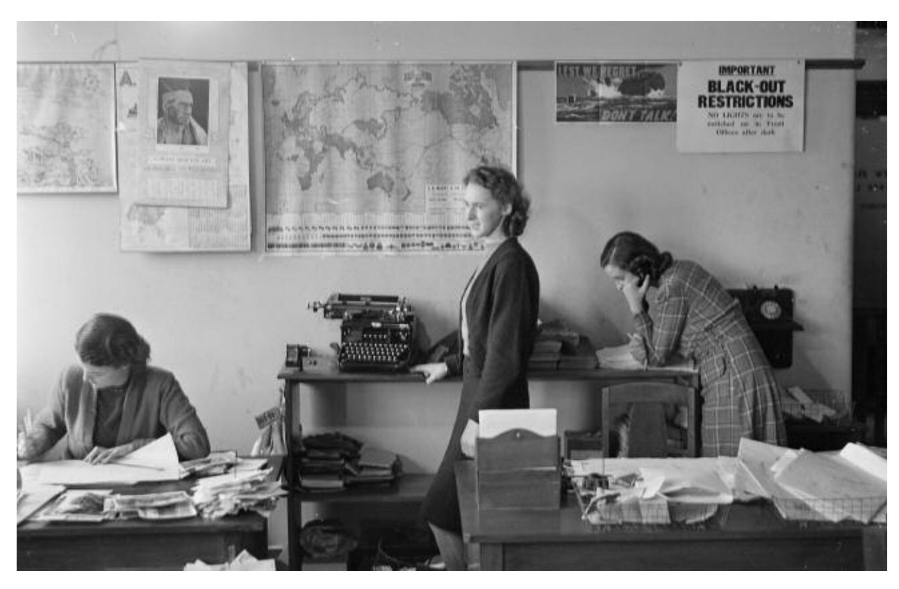
Fig. 3 A 'Lest We Regret' poster shares wall space in an office with maps, calendars and black-out instructions, New Zealand, early 1940s.

The editor of Display World at that time was very supportive and published the following editorial in October 1961: