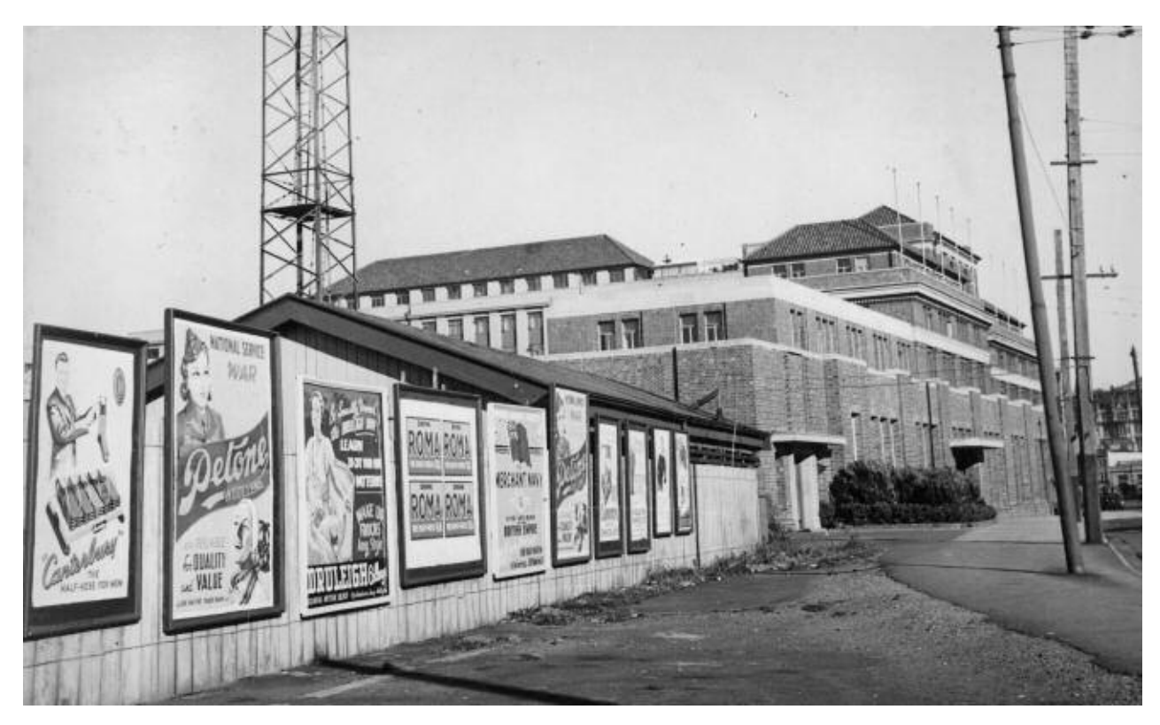
Fig. 1 Hoardings featuring large commercial posters obscuring the rail yards behind Wellington Railway Station, 1945. These posters were neatly framed to guard against criticisms of visual pollution, and include a Merchant Navy poster and a commercial poster from Petone Woollens tapping into the needs of women undertaking National War Service.