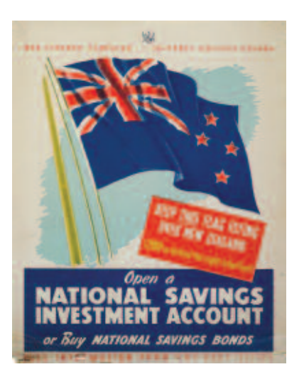
Fig. 12 Poster, 'War Finance Campaign', October 1940 (artist unknown; printed by E.V. Paul, Government Printer; issued by the New Zealand National Savings Committee, Wellington. Three-colour block print with screened offset lithographic image on paper, 568 x 442 mm. Gift of Mr C.H. Andrews, 1967. GH015509, Te Papa). The Railways Department mounted 496 copies of this poster in its stations throughout the country as soon as the Minister of Finance announced the National Savings scheme on 10 October 1940 (R. Mathews to District Traffic Managers and Stationmasters, 11 October 1940, R 18, W2496, 172, ANZ). As the scheme was considered a war measure, the Railways Department distributed and displayed the posters free of charge (Ashwin to General Manager, NZ Railways, 2 October 1940, R 18, W2496, 172).

Other early war posters were commissioned by the government for National Service and National Savings. 'Volunteer for National Service' (Fig. 11) was an appeal aimed at all civilian men and women to join in the war effort at home. National Service included the Home Guard, the Women's War Service Auxiliary and the Emergency Precautions Scheme (EPS), all of which backed up New Zealand's home defence forces. Many New Zealanders over the age of 16 gave thousands of unpaid hours to these organisations. The visual balance of the man and woman in this poster conceals the social conflicts and political debates behind female involvement in war work. On closer