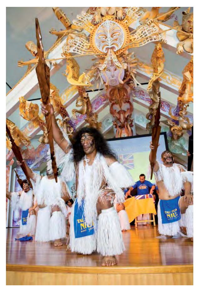
Fig. 22 Tau Fuata Niue dance group performing at Te Papa, 2008.

for the museum to collect and document contemporary changes in Niuean material culture. For example, in 2005 a complete Niuean female dance costume was acquired from Auckland Girls' Grammar School in Auckland. It had been worn in the ASB Bank Auckland Secondary Schools Māori and Pacific Islands Cultural Festival, the largest Polynesian dance festival of its kind in the world. Although not made in Niue, the costume is a significant representation of Niuean cultural practice and identity in New Zealand.