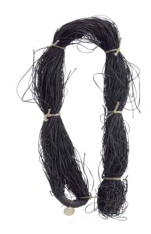
Fig. 9 Kafu lauulu (belt of human hair), Niue, c. 1800s, human hair. Artist unknown. Oldman collection. Gift of the New Zealand government, 1992 (Te Papa OL002138/1).

The collection has around 30 kato, each with a specific function and its own distinctive design. Some are cylindrical in shape while others are oblong or rectangular. Two baskets that are unique in design were collected by Captain John Peter Bollons (1862–1929), whose extensive collection was purchased by the Dominion Museum from his widow in 1931 (McLean 2007; Hutton et al. 2010). Most likely made during the early twentieth century, one of these kato is circular in shape with a lid and is made using the tia (openweave) technique from pandanus strips and coconut-leaf