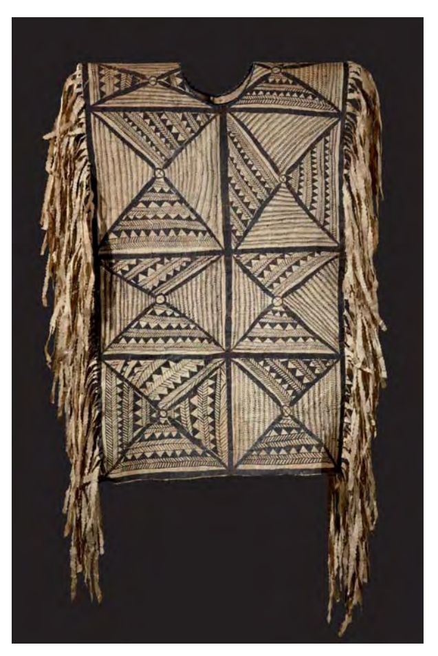
Fig. 4 Tiputa (poncho), Niue, c . 1800s, bark, dye. Artist unknown. Purchased 1914 (Te Papa FE000289).

Textiles in the Niue collection are made from a range of fibres that give an indication of changes in Niue's textile industry. For example, textiles made from the inner bark of the hiapo tree were produced following Samoan missionary influence from the 1840s until the artform declined at the end of the nineteenth century. Examples of garments in