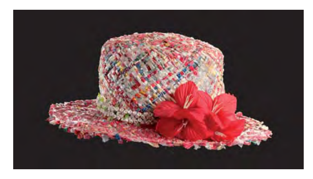
Fig. 13 Pulou (hat), Auckland, 1990s, plastic, nylon. Artist Moka Poi. Purchased 1999 with New Zealand Lottery Grants Board funds, acc. no. HY1999/030 (Te Papa FE011299).

a sort of plume worn at the back of the head, and kept in position by a band of hiapo round the head. They are made with a core of dried banana bark, round which is wound strips of hiapo having scarlet feathers of the Hega parroquet fastened on to them, and at top and bottom the yellow feathers of the Kulukulu dove are lashed on with