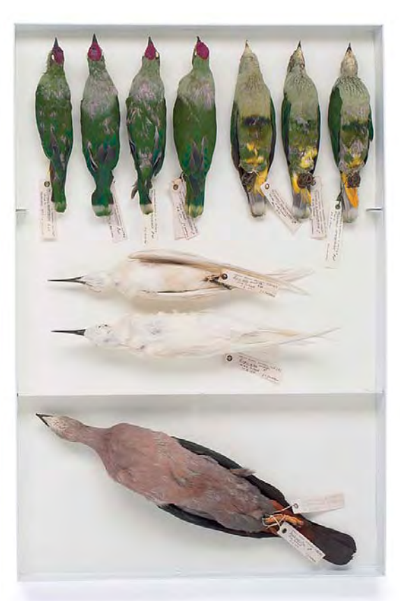
Fig. 15 A selection of bird skins from Niue, held in the Te Papa bird collection. Left case, bottom left to top right: buff-banded rail, Gallirallus philippensis goodsoni (OR.017764, OR.017763); tuaki/tavake or white-tailed tropicbird, Phaethon lepturus dorotheae (OR.017773, OR.017778); purple swamphen, Porphyrio porphyrio samoensis (OR.016387, OR.016388). Top right case, upper: kulukulu or purple-capped dove, Ptilinopus porphyraceus porphyraceus (OR.017747, OR.017744, OR.017745, OR.017743, OR.016392, OR.016391, OR.015827); top right case, lower: white tern, Gygis alba candida (OR.016396, OR.016397). Bottom right case: Pacific pigeon, Ducula pacifica (OR.017749).