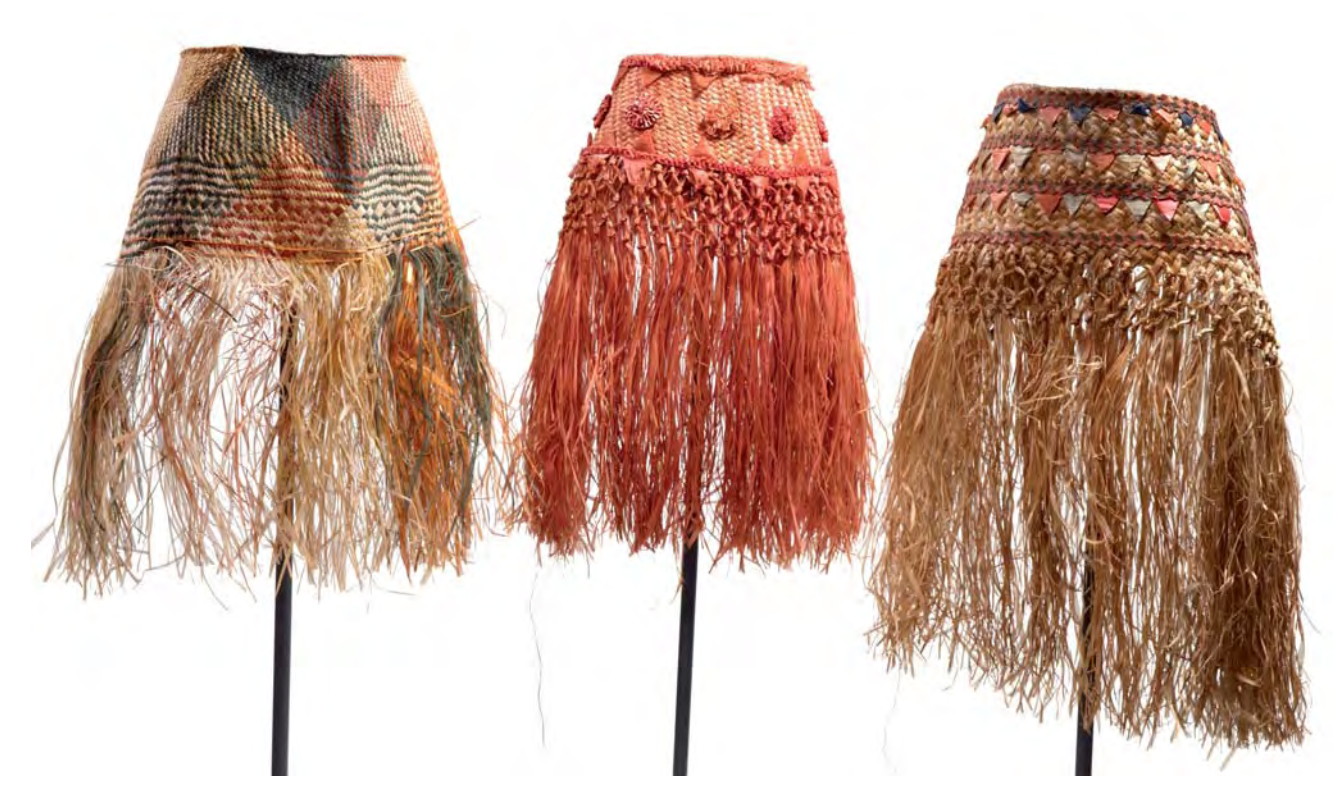
Fig. 7 Three titi (skirts) Niue, c. 1920s, hibiscus bast fibre, dye. Artist unknown. Purchased 1973, acc. no. 1973/39 (Te Papa FE006396, FE006397, FE006399).

The costumes are excellent examples of both the creative dying of natural materials and the incorporation of synthetic fibres by Niuean costume makers in recent years. With the increasing number of Niueans in New Zealand, weaving provides a chance to showcase creative work at events such as festivals, a source of income and a continued connection with home (Pereira in Mallon & Pereira 2002).