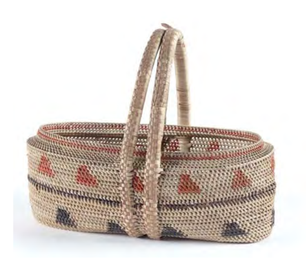
Fig. 10 Kato (basket), Niue, c. 1930s, pandanus fibre. Artist unknown. Purchased 1931 (Te Papa FE007907).

midrib (Cole et al. 1996: 38). The other kato is narrow, elongated and oval-shaped, with red designs (Fig. 10).