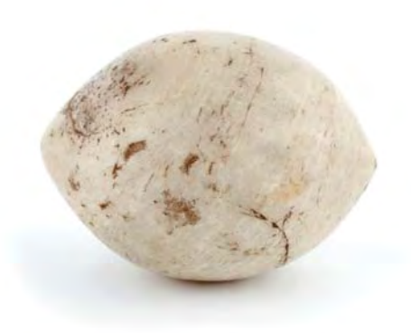
Fig. 1 Maka (throwing stone), Niue, c. 1800s, stone. Artist unknown. Gift of Reverend John Inglis, 1869 (Te Papa FE002241).

(clubs), kato (baskets), lei (necklaces) and tao (spears). Hiapo (tapa cloths) and tiputa (ponchos), both made from the beaten inner bark of the paper mulberry tree ( Broussonetia papyrifera ), also called hiapo, are significant rare examples of textiles. Historically, research interest in Niuean objects has centred mainly around such textiles.