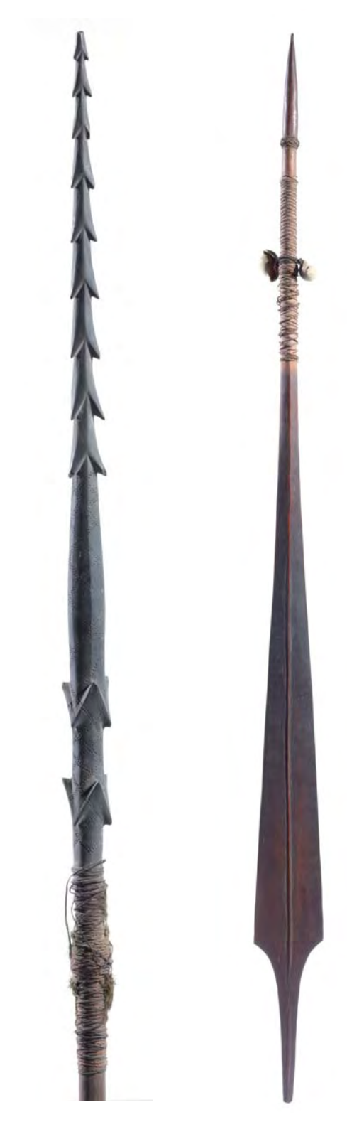
Left Fig. 16 Tao (spear), Niue, c. 1800s, wood, feather, sennit, hair. Artist unknown. Oldman collection. Gift of the New Zealand government, 1992 (Te Papa OL002092/1).