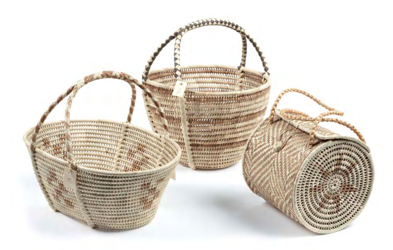
Fig. 11 Three kato (baskets), Niue, 1970s, pandanus, coconut midrib, hibiscus bast fibre. Artist unknown. Purchased 1971, acc. no. 1971/44 (Te Papa: left, FE006150; middle, FE006156; right, FE006157).

kato tupe (money purses), while others are oblong in shape with a folded-over lid. There are also strong oval ribbed baskets with 'V' handles for carrying heavy goods. In 1997, two unique kato laufa baskets were acquired, made by Elena Ikiua and Eseta Pati'i using harakeke (New Zealand flax; Phormium spp.) in a twill weave design.<sup>7</sup>