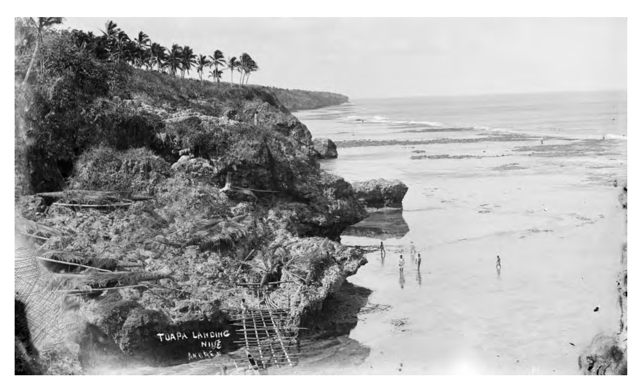
Fig. 19 Tuapa Landing, Niue, 1886-87 (photo: Thomas Andrew; Te Papa C.001516).

Dominion Museum, 28 July 1926). The department had exhibited Pacific objects from its Island territories – the Cook Islands, Niue, Samoa and Tokelau – at the exhibition. These included fruits, woven items, adornment pieces and canoes (Thompson 1927: 74). Of the three full-scale vaka, we have been unable to determine which was Gray's personal property and which belonged to the department.