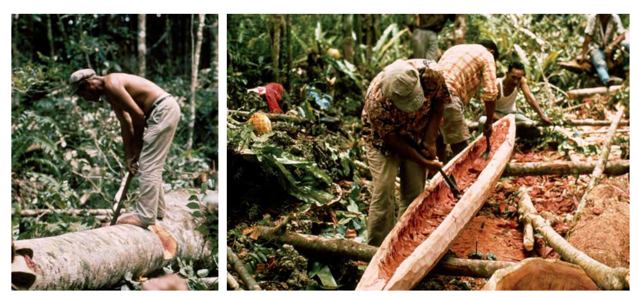
Left Fig. 20 Vaka making in Niue, 1972 (photo: Friedrich-Carl Kinsky; Te Papa CT.027508).