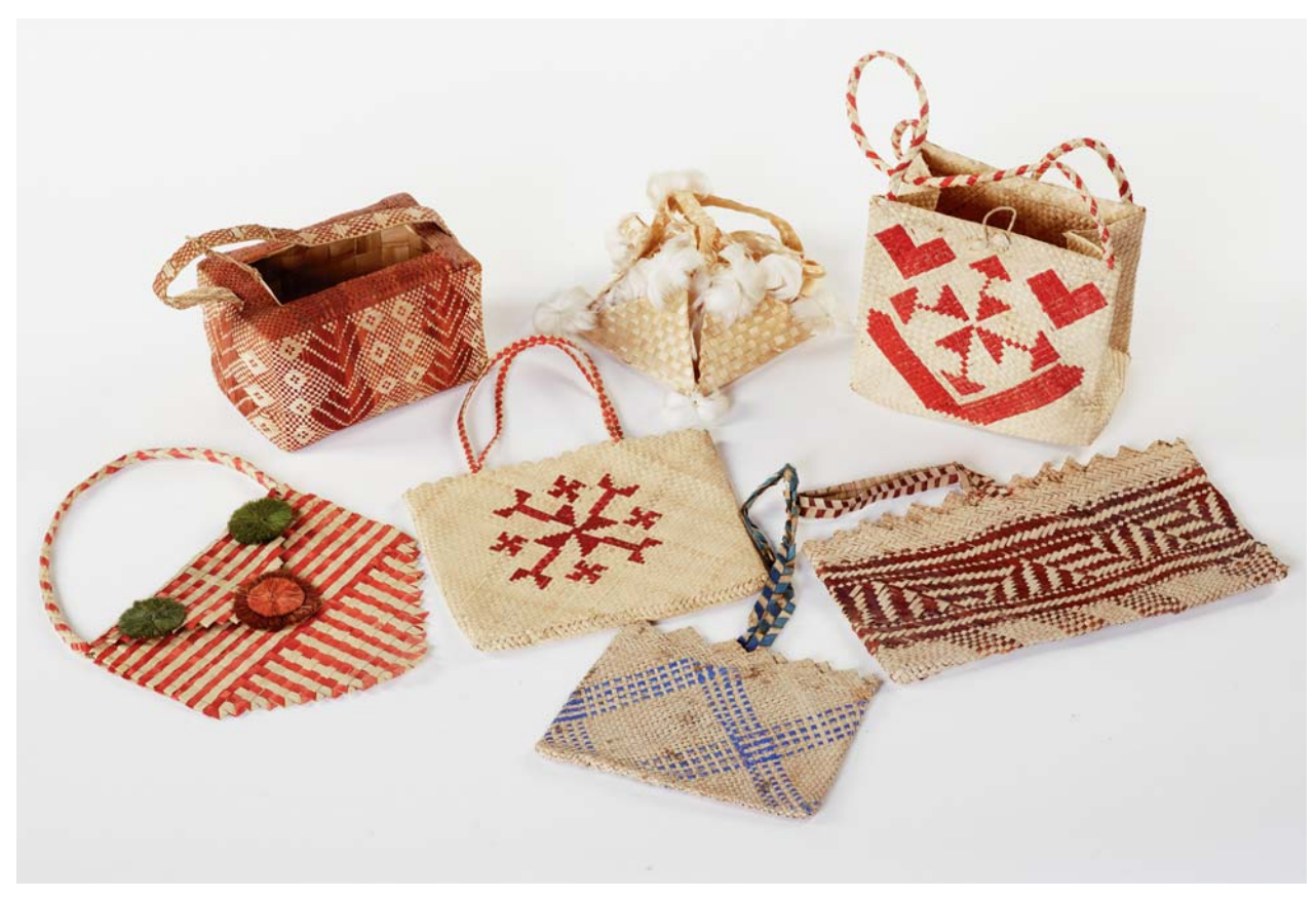
Fig. 10 Left to right: kete pāpā (satchel) Cook Islands, date unknown, pandanus fibre, 355×140 mm (Te Papa FE012041); kete po'o (basket), Cook Islands, date unknown, pandanus fibre, 890×100 mm (Te Papa FE012031); kete pāpā, Cook Islands, date unknown, pandanus fibre, 210×240 mm (Te Papa FE012034); kete pāpā kaka'o, Cook Islands, date unknown, fernland reed ( Miscanthus floridulus ), 120×220×220 mm (Te Papa FE012057); kete (basket), Cook Islands, date unknown, pandanus fibre, 200×130 mm (Te Papa FE012032); kete pāpā, Cook Islands, date unknown, pandanus fibre, 195×320 mm (Te Papa FE012035); kete pāpā, Cook Islands, date unknown, pandanus fibre, 160×200 mm (Te Papa FE012033). Artists unknown. Gift from Mr J.D. Hutchin, 1948.