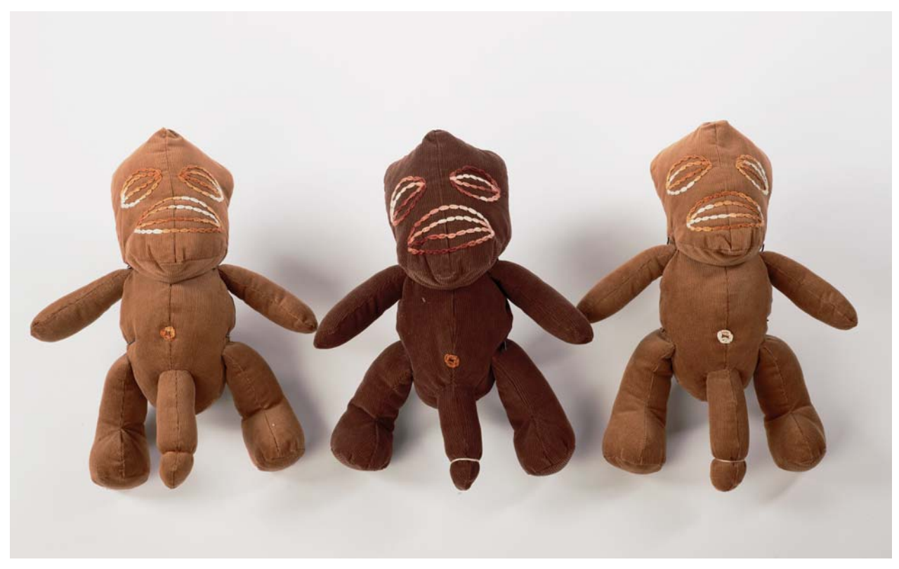
Fig. 23 Tangaroa, New Zealand, 1992, corduroy, c. 370×320×200 mm. Artist Ani O'Neill (Te Papa FE010521-3).

acquired for the collection. O'Neill's work has explored the textile techniques of Cook Islands women through such stunning pieces as Rainbow country (2000-01) and Star by night (1994), and a series of 'cuddly' cloth dolls called Tangaroa (1992), three of which are held in Te Papa's collections (Fig. 23). Collecting contemporary artworks made for gallery contexts expands the possibilities of representing Cook Islands people and their experiences through material culture. The increasing number of professional artists producing and exhibiting artworks in both New Zealand and the Cook Islands will surely develop the collection even further in this area.