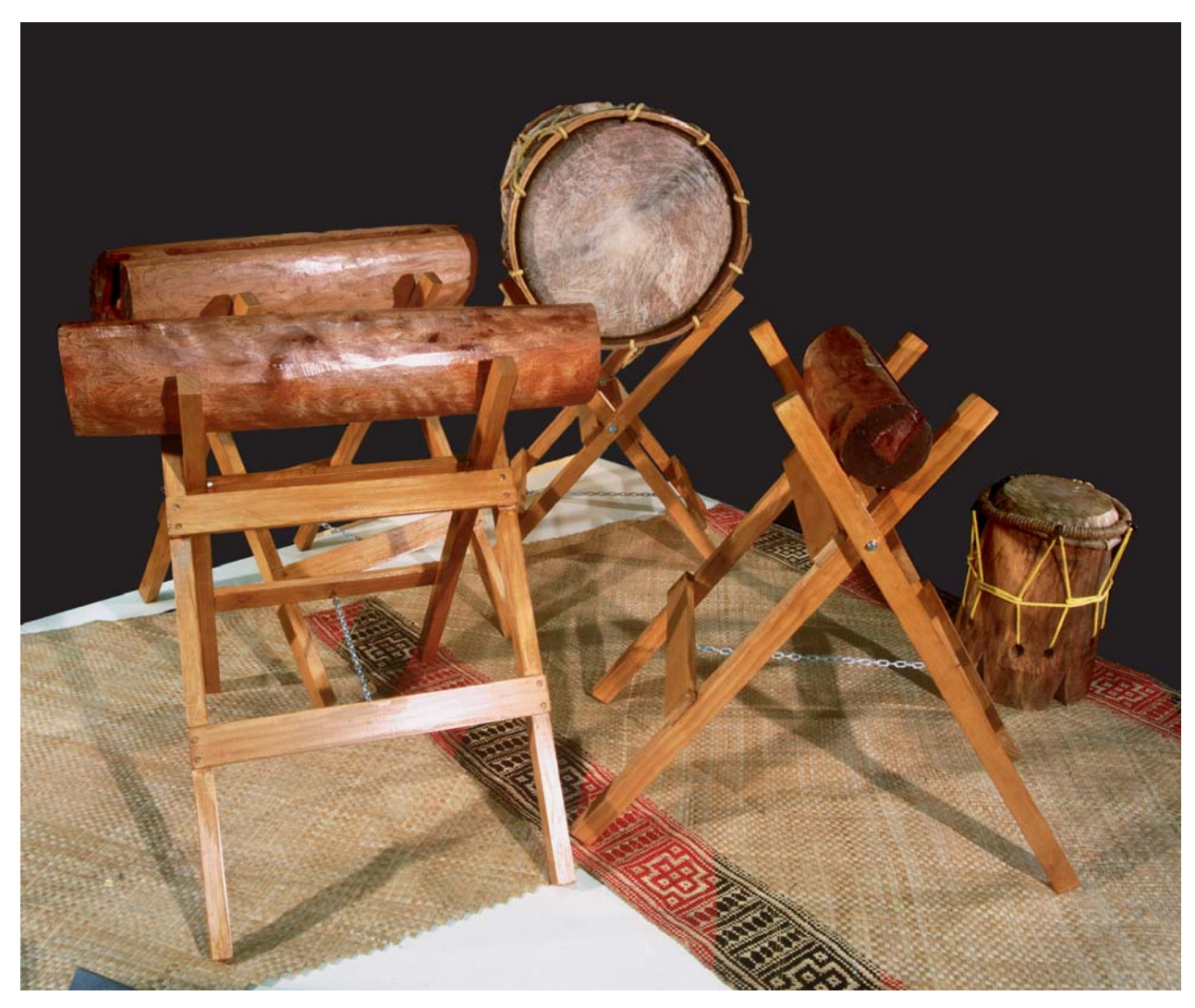
Fig. 18 Tini kā'ara (drum kit), Aitutaki, Cook Islands, 1992, wood, goat skin, metal, synthetic rope. Artists Rurutaura Tauta and Teokota'i Pita. Purchased 1992 with Lottery Board Funds, acc. no. 1993/54 (Te Papa photo negative F.004471/01).

of the museum. While Walter was in the Cook Islands, he obtained a number of tīvaevae, one of which was made on the island of Aitutaki and represents the legend of Ina and the shark. Walter also facilitated the acquisition of a small outrigger vaka from Maʻuke and a complete drum kit from Aitutaki (Fig. 18). The collection is well documented, listing the names of makers and indigenous materials used.