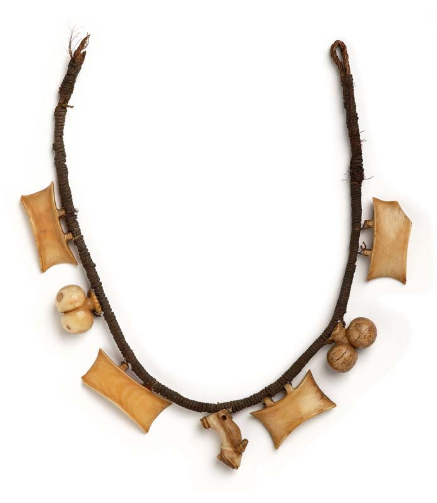
Fig. 13 Rei (necklace), Mangaia, Cook Islands, 1800s, sea-mammal ivory, bone, coconut fibre, human hair, length 470 mm. Artist unknown. Oldman collection, purchased 1948 (Te Papa OL000479).

at the base, indicating that it may have been the handle of a sacred flywhisk. Oldman recorded that it came from the Hervey Islands (an old name for part of the southern Cook Islands), although some scholars have attributed it to the Society Islands on stylistic grounds. Its history indicates that it was brought to England in 1825 by George Bennett, a London Missionary Society worker based in the Society Islands. During the 1820s, many 'idols' from the Cook Islands fell into missionary hands. A number of them were illustrated and described by the missionary William Ellis (1829), and were subsequently acquired by Oldman, including this piece. One of the shortcomings of the Oldman collection is that because the items passed through various sale rooms in Britain, they often lack detailed information on their origins or historical context. Despite this, their quality is outstanding.