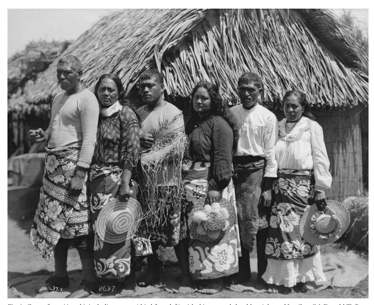
Fig. 8 Group from Aitutaki, including a man (third from left) with skirt around shoulders.

styles of Cook Islands objects that were made and collected did not change much. As Davidson notes (1997: 175), 'some items, such as fish traps, sandals, tapa, tapa beaters, slit drums, pitching games and pounders had probably changed little, if at all, over a long period'.