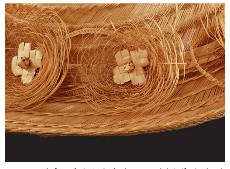
Fig. 17 Detail of pare (hat), Cook Islands, c. 1920s, kāka'o (fernland reed, Miscanthus floridulus), 400 \times 37 \times 115 mm. Artist unknown. Gift from Mrs Edith M. Paterson, 1954 (Te Papa FE008434).