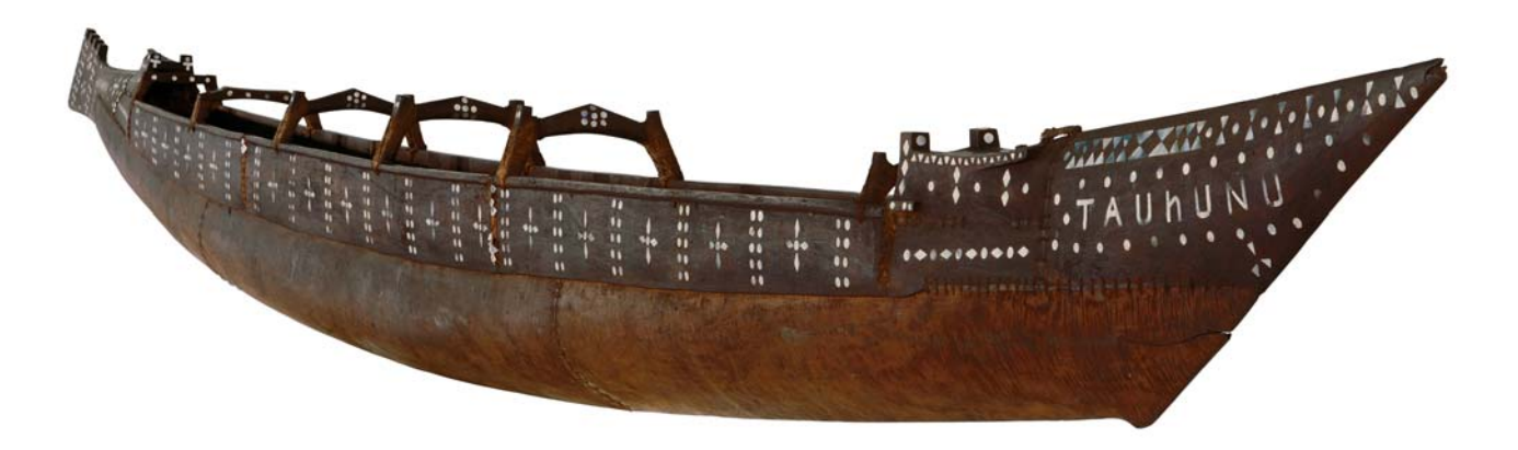
Fig. 5 Tauhunu vaka (canoe), Manihiki, Cook Islands, c. 1900, wood, pigment, pearl shell, 8860 × 430 mm. Artist unknown (Te Papa FE010422).

own body (Hīroa 1911). The carved star motif on the bow is believed to have been used as a navigational aid. A'ua'u is just over 4 m long. British explorer Captain James Cook saw painted vaka this size at sea in the 1700s. However, A'ua'u is not a voyaging vessel, which could measure up to 9 m in length, and would have been used for fishing and short journeys instead.