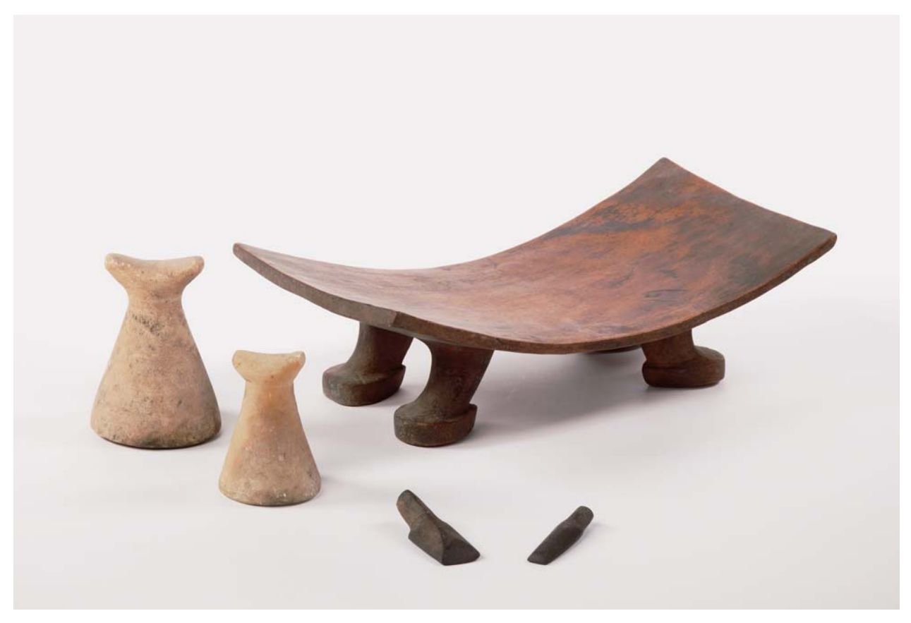
Fig. 11 Clockwise from back left: reru (pounder), Cook Islands, date unknown, 125 (height) × 85 (diameter) mm (Te Papa FE06146); noʻoanga (seat), Cook Islands, date unknown, wood, 158 × 503 mm (Te Papa FE008395); toki (adze blade), Cook Islands, date unknown, 102 × 24 mm (Te Papa FE006408); toki, Cook Islands, date unknown 130 × 38 mm (Te Papa FE006409); reru, Cook Islands, date unknown, 155 (height) × 88 (diameter) mm (Te Papa FE008392). Artists unknown. Purchased 1931.

Affairs Department, on 16 July 1931, Walter R.B. Oliver, the museum's director at the time, welcomed Bollons' collection 'on account of the high ethnological value'. The collection comprises 5107 Māori artefacts and specimens, 42 Pacific artefacts and 9 items related to Pākehā history. The massive number of Māori specimens and artefacts reflects Bollons' main collecting interest. Seven of the 42 Pacific items in the Bollons collection are from the Cook Islands: a kumete roroa (long bowl), a kete pāpā (satchel), and a no 'oanga (seat), two toki (adze blades) and two reru (pounders) (Fig. 11).