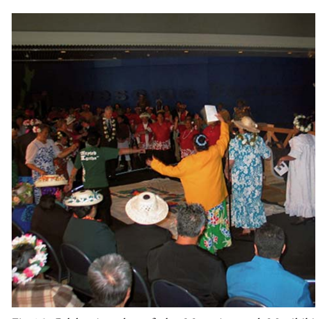
Fig. 25 Celebration day of the Mangaian and Manihiki communities, Te Papa, 2006.

The communities' enthusiasm during preparations for the event was such that they were involved in carrying the crated Tauhunu vaka up a flight of stairs from the Level One public entrance to a public space on Level Two. The Wellington Manihiki/Rakahanga group arrived at 6pm on Friday, 10 November to assist with setting up for the momentous occasion. In total, about 30 Cook Islands people and seven Te Papa staff gathered around the crate. Following