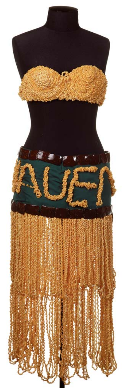
Fig. 19 Costume, Cook Islands, 1995, shell, cloth, coconuthusk fibre, plant fibre. Artist Lily Marsters, Porirua. Purchased 1995 (Te Papa FE010630).

The Cook Islands collection includes a number of objects obtained from Mi'i Quarter, a Cook Island designer of