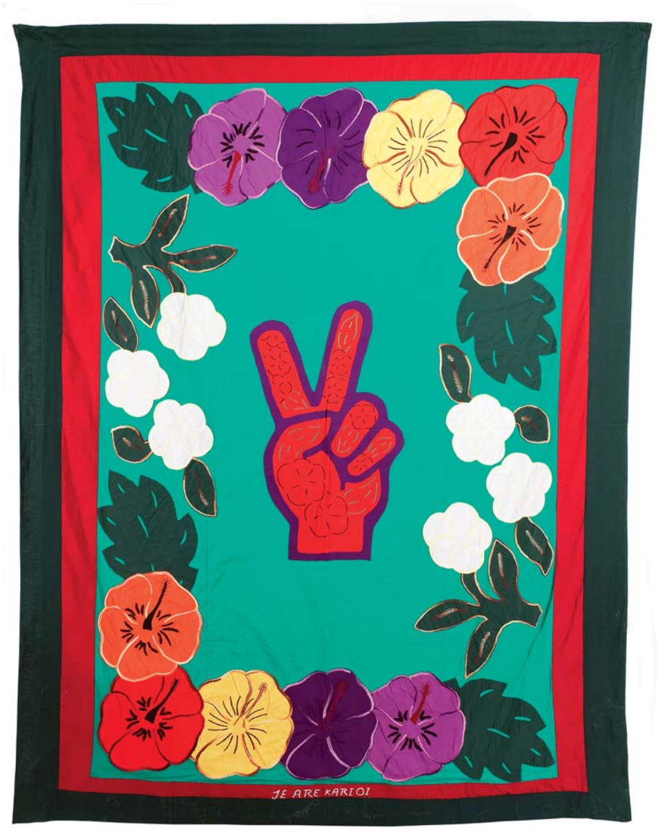
Fig. 20 Tīvaevae tataura (embroidered appliqué quilt), New Zealand, 1996–97, cotton, 2160×2740 mm. Artist Miʻi Quarter, Auckland (Te Papa FE011186).

from time to time – generally in the summer months – to sell their work.