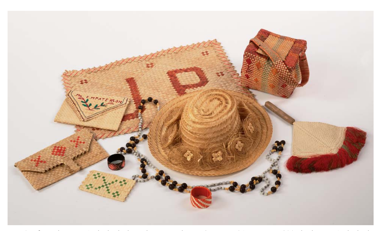
Fig. 16 Left to right: purse, Cook Islands, date unknown, pandanus, 145×81 mm (Te Papa FE008468); clutch purse, Cook Islands, date unknown, pandanus, 140×240 mm (FE008458); clutch purse, Cook Islands, c. 1920s, pandanus, wool, 203×158 mm (Te Papa FE008460); tablemat, Cook Islands, date unknown, pandanus, 575 ×380 mm (FE008469); kete poʻo (handbag), Cook Islands, date unknown, pandanus, 270×164×145 mm (FE008490); napkin ring, Cook Islands, date unknown, pandanus, 26 (height)×40 (diameter) mm (Te Papa FE008486); 'ei (necklace), Cook Islands, date unknown, pupu shells, ua puka (puka seeds), poepoe (Job's tears) seeds, length 2300 mm (Te Papa FE008516); napkin ring, Cook Islands, date unknown, pandanus, 34 (height) x 52 (diameter) mm (Te Papa FE008483); pare (hat), Cook Islands, c. 1920, kāka'o (fernland reed, Miscanthus floridulus) (FE008434); tă'iri (fan), Cook Islands, date unknown, rito (coconut leaf), kiri'au (hibiscus fibre), 355×305 mm (Te Papa FE008445). Artists unknown. Gift from Mrs Edith M. Paterson, 1954.