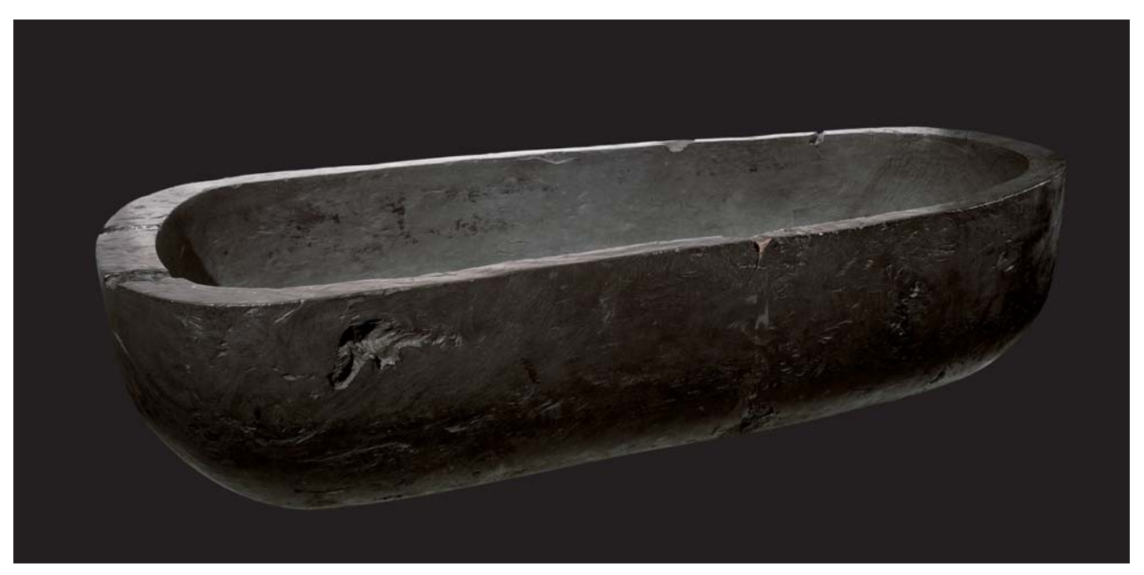
Fig. 21 Paroe (large food bowl), attributed to Ātiu, Cook Islands, c. 1900, wood, 3350×1150×810 mm. Artist unknown (Te Papa FE010517).