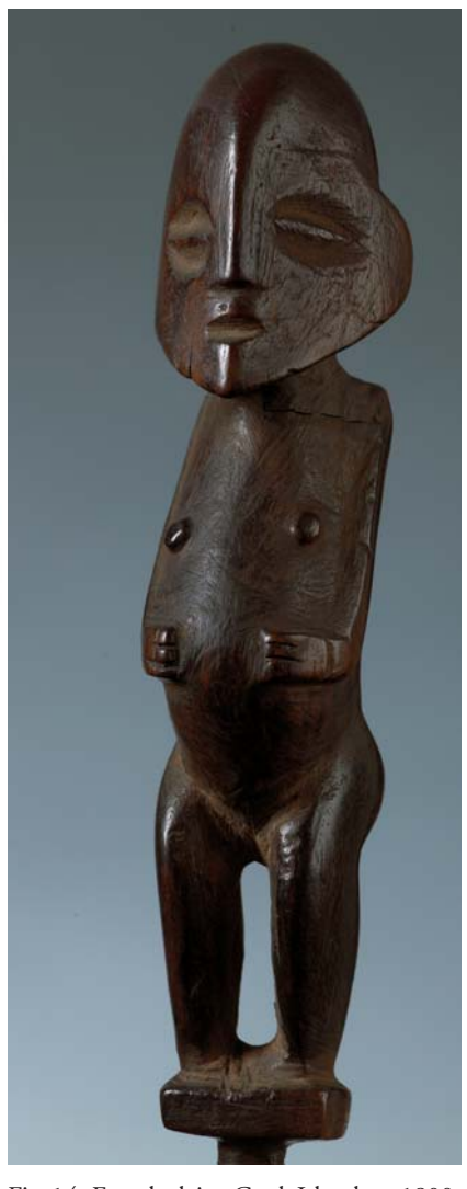
Fig. 14 Female deity, Cook Islands, c. 1800, wood, 130×35 mm. Artist unknown. Oldman collection, purchased 1948 (Te Papa OL000370).

at the base, indicating that it may have been the handle of a sacred flywhisk. Oldman recorded that it came from the Hervey Islands (an old name for part of the southern Cook Islands), although some scholars have attributed it to the Society Islands on stylistic grounds. Its history indicates that it was brought to England in 1825 by George Bennett, a London Missionary Society worker based in the Society Islands. During the 1820s, many 'idols' from the Cook Islands fell into missionary hands. A number of them were illustrated and described by the missionary William Ellis (1829), and were subsequently acquired by Oldman, including this piece. One of the shortcomings of the Oldman collection is that because the items passed through various sale rooms in Britain, they often lack detailed information on their origins or historical context. Despite this, their quality is outstanding.