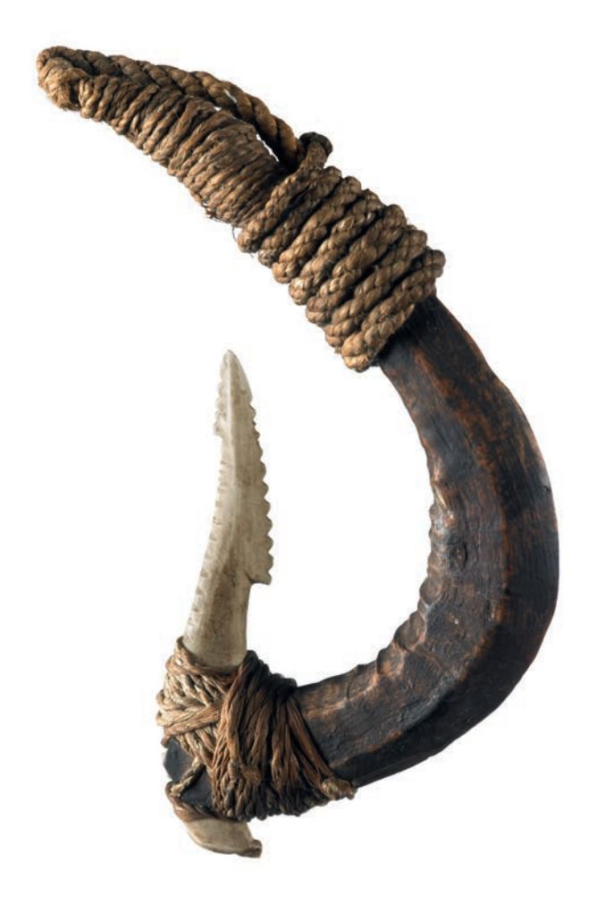
Fig. 1 Composite hook with a strong, curved wooden shank, made by training a growing plant to the desired shape and lashing it to a bone point, 128×99 mm (Museum of New Zealand Te Papa Tongarewa: ME 014838).

Māori and frequently provided metal nails in exchange for supplies of fish. At Hawke Bay, a few days after sighting New Zealand in late October 1769, Cook gave local Māori gifts of linen cloth, trinkets and spike nails, and noted that they placed 'no value' on the metal nails (Beaglehole 1955). Several weeks later, however, in February 1770 off Cape Palliser, 200 km south of Hawke Bay, the crews of three canoes boarded the Endeavour and requested nails, which they had heard of but not seen (Salmond 2003).