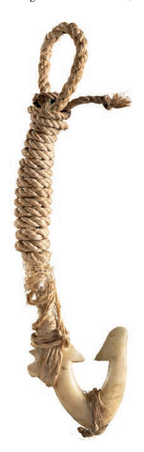
Fig. 5 Internal-barb hook with line, 30.4 \times 26.9 mm (Museum of New Zealand Te Papa Tongarewa: ME 004877).