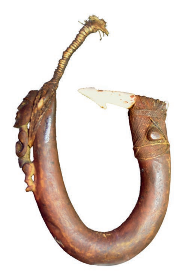
Fig. 2 A unique composite Māori fishhook with a carved figure on the shank, almost certainly from Cook's second or third voyage (National Museum of Ireland, Dublin: AE1893-760).

Unfortunately, the numerous items from New Zealand in the National Museum of Ireland were not clearly labelled and became mixed during reorganisation of the collections in the early twentieth century, to the extent that it is not possible to identify items collected during Cook's voyages from those in the Meyler and later collections (Cherry 1990). However, one composite wooden hook with a bone point (Fig. 2) held in the museum's collection (item NMI AE1893-760) is of great interest. It is stoutly made and has a detailed carving of a full human figure on the shank. This hook is one of two illustrated in the early nineteenth century by Digby (1810-1817) (Fig. 1, left). The second hook illustrated by Digby (Fig. 1, right) is also a composite wooden hook with a bone point and may possibly be item