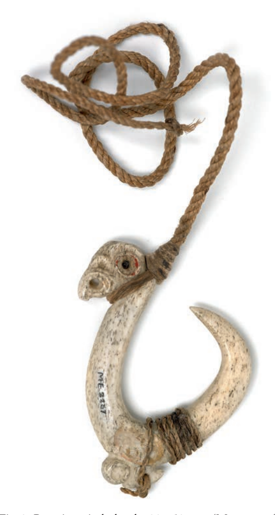
Fig. 2 Rotating circle hook, 80 \times 53 \,\mathrm{mm} (Museum of New Zealand Te Papa Tongarewa: ME 002237).

U-shaped, or jabbing, hooks required the use of short rods. These hooks were fished with a short line and the rod was used to flick the fish out of the water into a canoe, in a