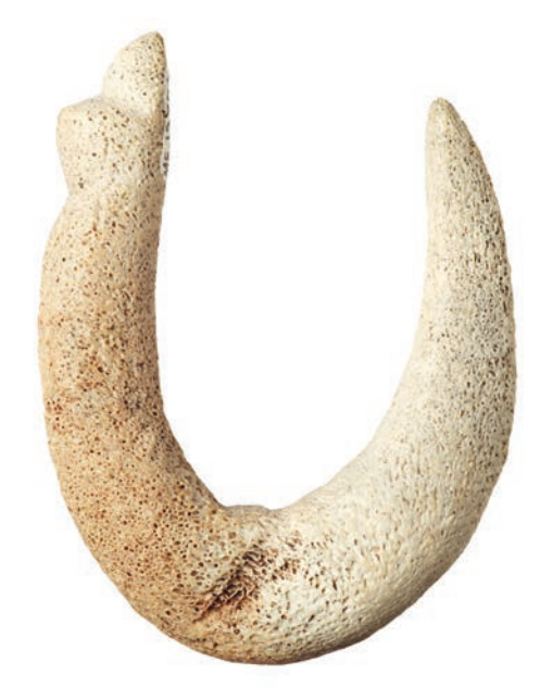
Fig. 3 U-shaped, or jabbing, hook, 67 \times 50 \,\mathrm{mm} (Museum of New Zealand Te Papa Tongarewa: ME 013790).