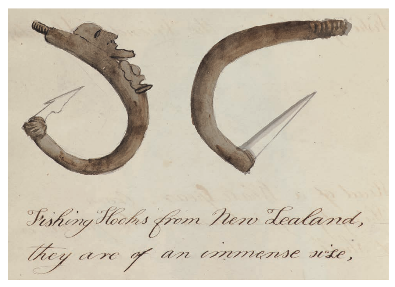
Fig. 1 Fishing hooks from New Zealand illustrated in Kenelm H. Digby's 'Naturalist's companion' (1810–1817: 215).

many hooks passed from collector to collector and original details have been lost. Today, artefacts from Cook's voyages are represented in almost every major European museum (Kaeppler 1978a, b; Paulin 2010), and more than 100 smaller museums and private collections throughout Europe hold collections of early Māori artefacts (Hooper 2006; Arapata Hakiwai, pers. comm. 2010).