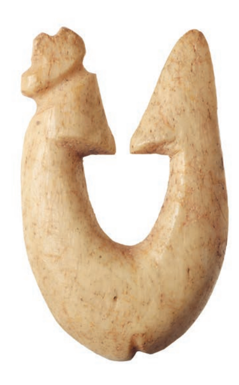
Fig. 4 Internal-barb hook, 30 \times 18.8 \,\mathrm{mm} (Museum of New Zealand Te Papa Tongarewa: ME 023204).

New Zealand flax (harakeke, Phormium spp.) provided fibrous material for fishing lines and was recognised in the early 1800s as equal, or superior in quality, to the jute, hemp and sisal in use by Europeans at the time (Polack 1838; Beaglehole 1955). Lines were made from prepared flax fibres, or muka, by rolling the fibres on the bare thigh with the palm of the hand. Two lengths of rolled twine, or takerekere,