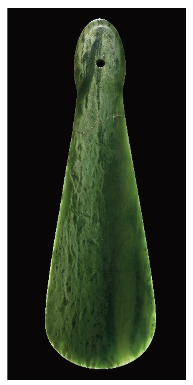
Fig. 7 Mere pounamu (greenstone hand club) Te Takere, New Zealand, 1500s, kawakawa (dark pounamu [greenstone]), 365×115×21 mm. Ngā Ruahine (attributed) (Te Papa ME013928).

Te Porohanga, his famous divining rod or staff. On 11 July 1868, at Te Ngutu-o-te-manu, this sacred taiaha helped Tītokowaru select his fighting 12 'Te kau ma rua' (Belich 2010: 83). The 12, along with 50 others (who did not include Tītokowaru), successfully attacked Turuturu Mōkai, a British constabulary redoubt, that night (Belich 2010: 86).