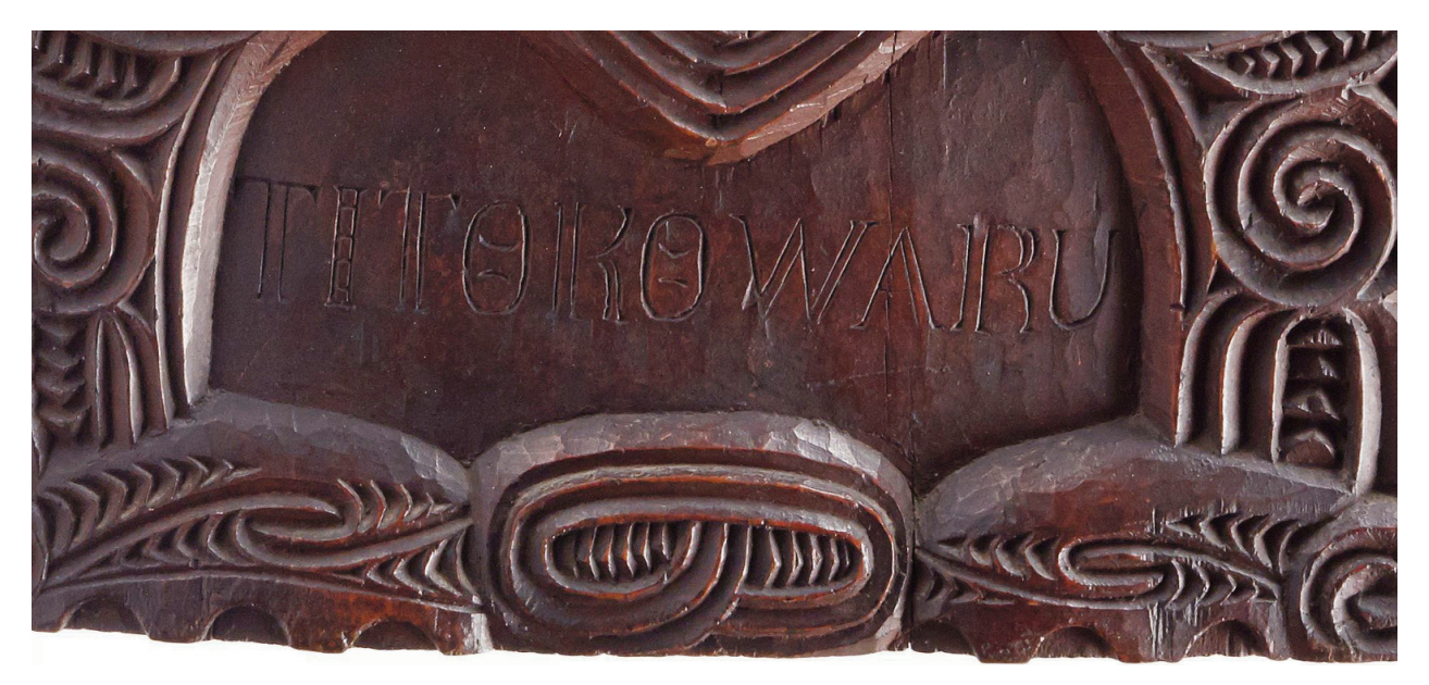
Fig. 3 Tītokowaru poupou. Close-up of the writing at the bottom of the carving (Te Papa ME002589).