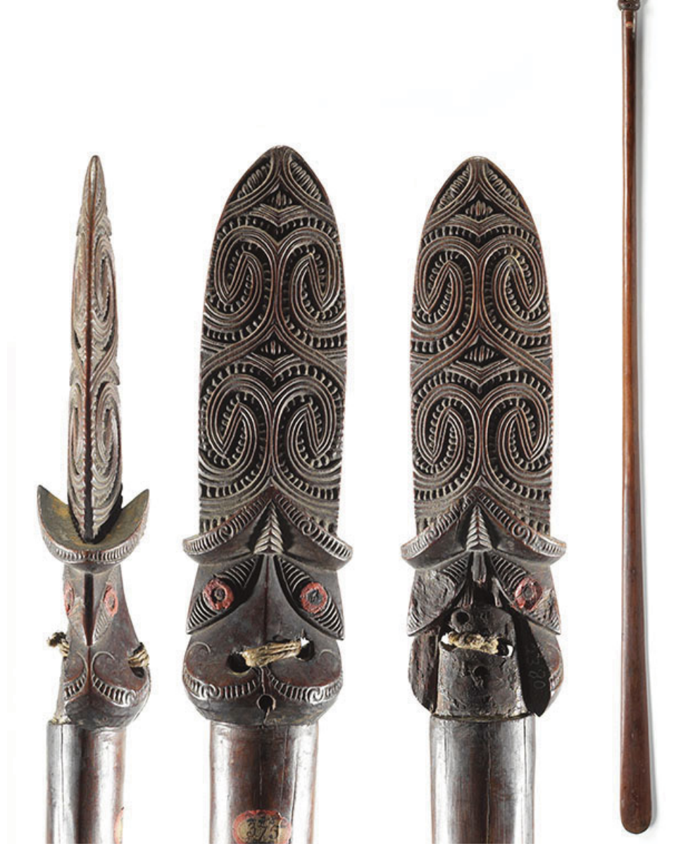
Fig. 6 Taiaha (long fighting staff), Te Porohanga (assumed), New Zealand, 1800s, wood, red sealing wax, kōkōwai (red ochre), cordage, 1720 × 61 × 25 mm. Maker unknown (Te Papa ME002380).

Further research into the origins of the Tītokowaru carving may be undertaken by studying the patterns that are unique to this poupou, potentially making connections with carvers or carving styles from various iwi and regions. Some carvers incorporate a signature or sign that is unique to them, and it is possible this may be the case for this poupou (Simmons 1986: 85). Talking to carvers could also shed some light on its origins. More information can possibly be