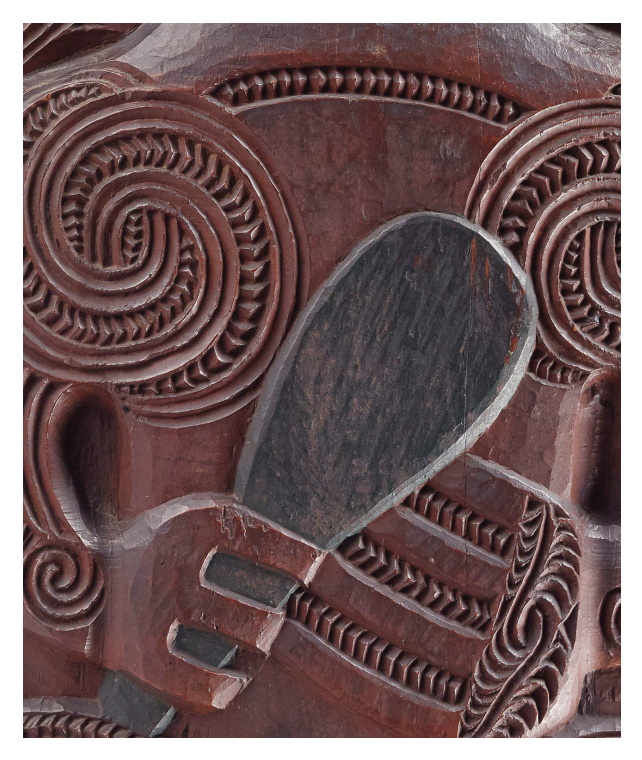
Fig. 4 Tītokowaru poupou. Close-up of the mere (hand club) (Te Papa ME002589).