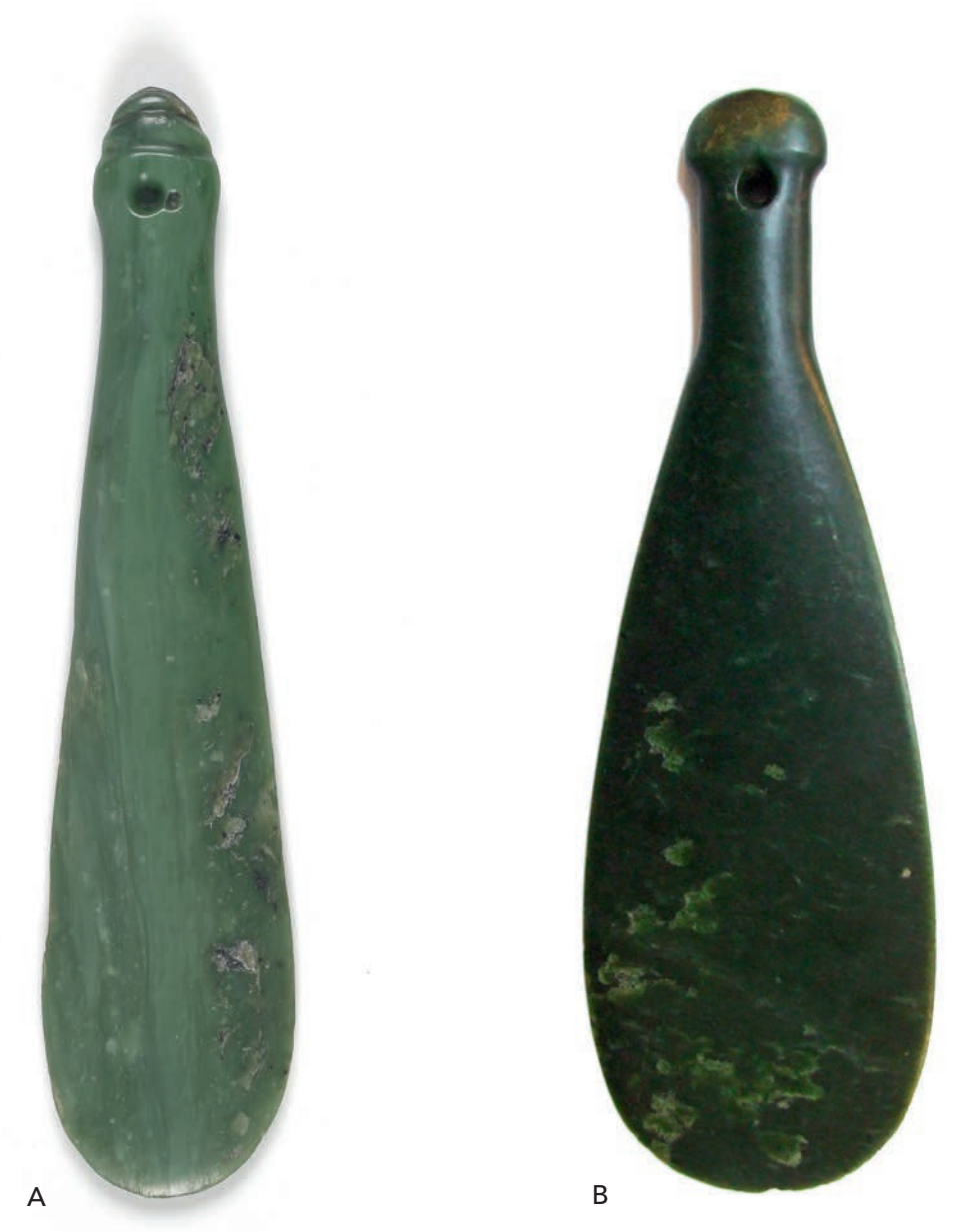
Fig. 6 Two mere pounamu (greenstone clubs) originally in the possession of Captain William Hobson. One of these was presented by Patuone on 6 February 1840 and intended for Queen Victoria. A, 'mere pounamu with three grooves on butt, pre-European drilled hole. Pale green, 15 inches, greatest width 3.5 inches' (Te Papa ME 010819); B, '19th century, dark green with paler flecks, with a fairly thin blade and a slight chip on the top edge, the butt without ridges and a bi-conical perforation' (Waitangi National Trust WNT1961/1/1; reproduced with permission).