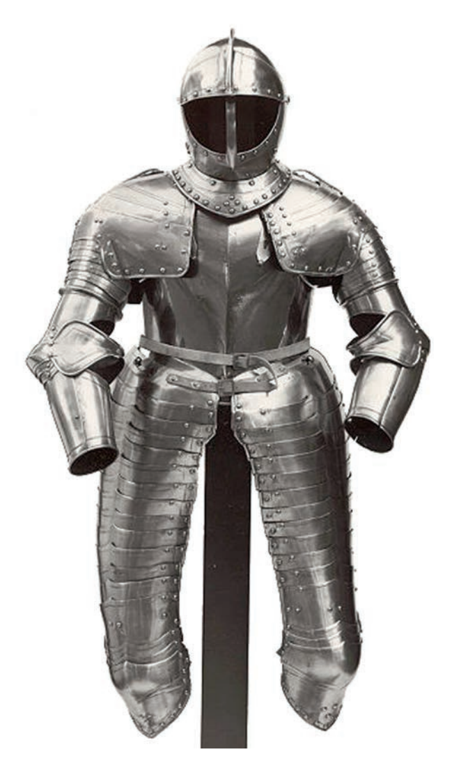
Fig. 3 A suit of cuirassier armour matching the general description of that supplied to Patuone and Titore, c . 1630, made in the Netherlands (collection of the Royal Armouries, Tower of London, II.104, © Board of Trustees of the Armouries; reproduced with permission).

The Colonial Office took notice of Sadler's letters, ensuring that the armour for Patuone was indeed on board the Buffalo , but on 15 July 1836 Sadler was replaced as commander of the ship by James Wood. Hindmarsh wrote from Spithead on 3 August 1836 that he was at last underway, and on 27 December he reached Holdfast Bay, in South Australia (Campbell 1988). He remained there with the Buffalo until 14 June 1837, by which time there was war in the Bay of Islands and Titore had been killed by Pomare II. By a curious coincidence, William IV had died just two days earlier. Governor Bourke advised Lord Glenelg on 19 September 1837 that the Buffalo was cleared to resume the spar trade to Hokianga (Campbell 1988: 24). This was