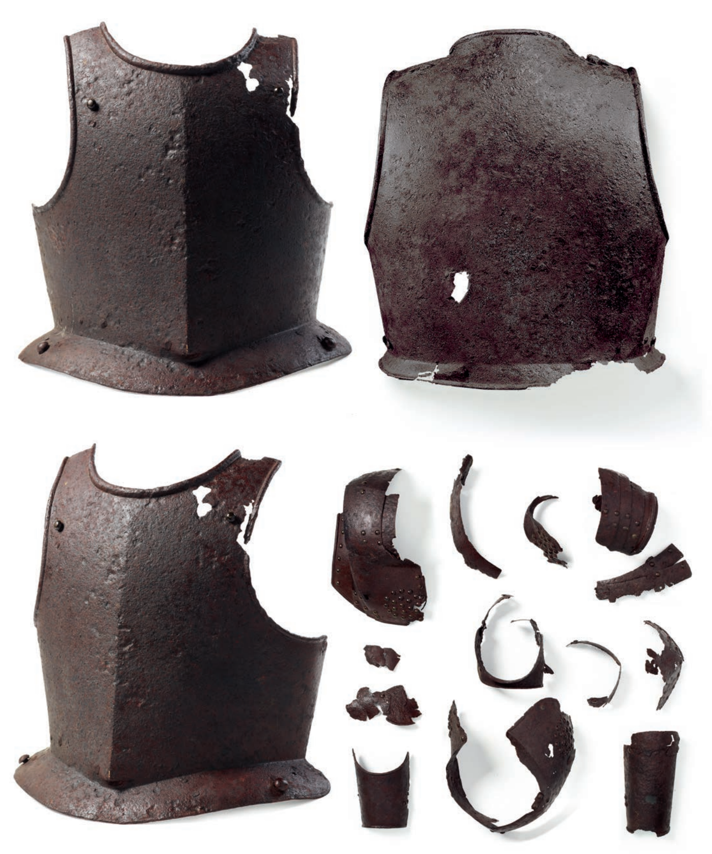
Fig. 2 Armour of Titore (Te Papa collection ME 001845).