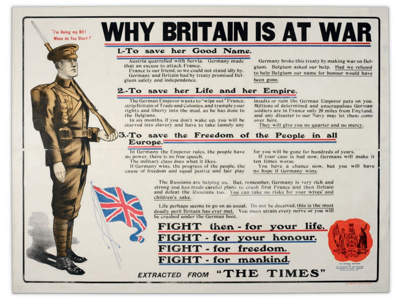
Fig. 14 Poster, 'Why Britain is at War', 1915 (printed by Lyttelton Times Company, Christchurch. Letterpress and lithograph on paper, 765×1010 mm. AD 1 917 44/235 SEP 412, Archives New Zealand). This poster is based on a British poster published in December 1914 (IWM PST 0948, Imperial War Museum, United Kingdom). It is notable for its large size and colour image, contrasting with New Zealand's smaller, text-only official posters of the same period.

the 'Lion' poster, and was widely seen in New Zealand from mid-1915 (Figs 12, 13). In this image, the young lion cubs (Australia, Canada, India and New Zealand) do not rebel against the 'Old Lion' (Britain) but take their place by their father's side (McKinnon 1993: 239).