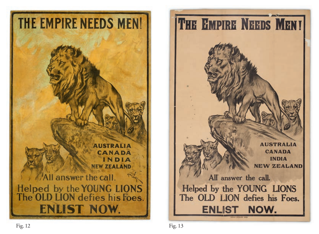
Fig. 12 Poster, 'The Empire Needs Men!' [also known as the 'Lion' poster], 1915 (by Arthur Wardle (1864–1949, England); printed by Straker Brothers Ltd; published by Parliamentary Recruiting Committee, United Kingdom. Chromolithograph on paper, mounted on board and varnished, 762×503 mm. Gift of Department of Defence, 1919. GH016383, Te Papa). The 'Lion' poster was originally printed without the list of countries (with 'The Overseas States all answer the call' instead). It was modified for farflung parts of the British Empire, and a large supply was printed by the New Zealand government and distributed throughout the country to encourage recruiting (Allen to Mackenzie, 25 May 1916, 12 May 1919; Andrews to Australian War Museum, 15 January 1920; Anonymous 1915b). It was also slightly reworked locally by the New Zealand Herald , demonstrating the flexibility of such propaganda (Fig. 13).

Fig. 13 Poster, 'The Empire Needs Men!' 1915 (original design by Arthur Wardle, United Kingdom; redesigned and printed by the New Zealand Herald , Auckland. Letterpress and offset print on paper, 764 × 505 mm. AD 1 9/169/2/1 SEP 598, Archives New Zealand, Wellington).