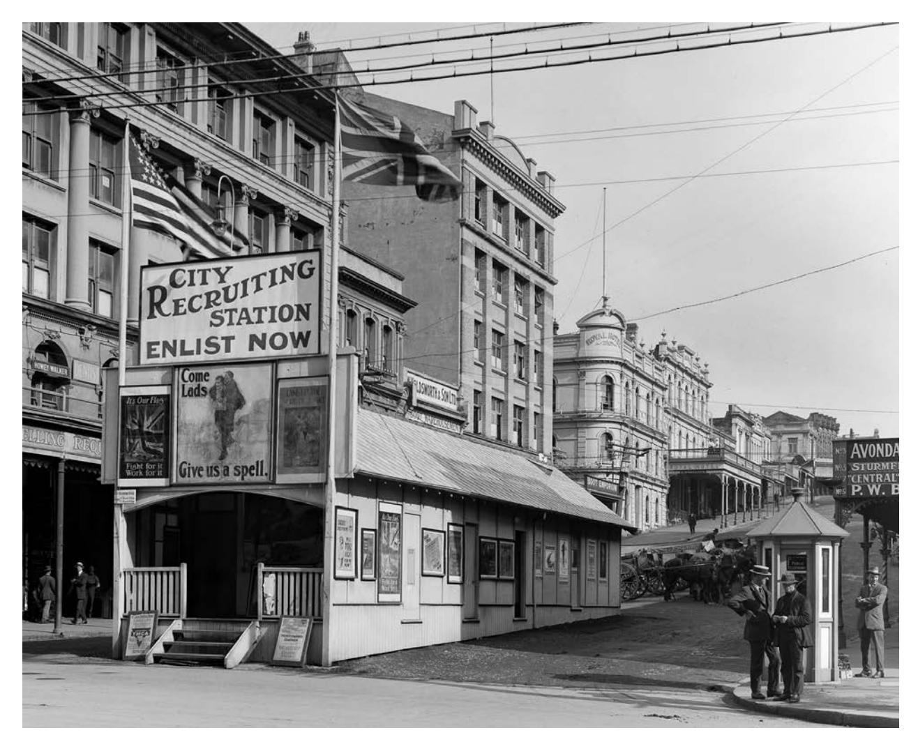
Fig. 1 The Auckland City Recruiting Station on 23 April 1917. This photograph illustrates imperial networks in practice, with British, Australian and New Zealand recruitment posters neatly framed and displayed around the walls. These posters had been on display since at least March 1916, but would have been redundant by the time this photograph was taken as conscription had come into force eight months earlier. This indicates that the currency of such posters outlived their original purpose. For example, the large poster above the porch portrays soldiers in a Gallipoli-like landscape of 1915 ('Come Lads Give us a spell', 1915, by Annie J. Hope Campbell, published by the Victoria State Parliamentary Recruiting Committee, Australia). This landscape had long been left behind for the trenches of France by the time this photograph was taken (photo: Henry Winkelmann. Sir George Grey Special Collections, Auckland Libraries; 1-W1595).

What is of particular interest to this paper is the continuing engagement with war posters in the years immediately following the war until the early 1920s – a period when war 'moved to the heart of New Zealand identity' through increasing commemoration (Phillips 2000: 349). Posters were no longer seen in the streets, but were collected by museums, archives and individuals, and disseminated in publications and exhibitions worldwide. They were collected because they provided a window onto the war; they demonstrated participation and war effort; and they reminded audiences of the emotions of the war years. They were also