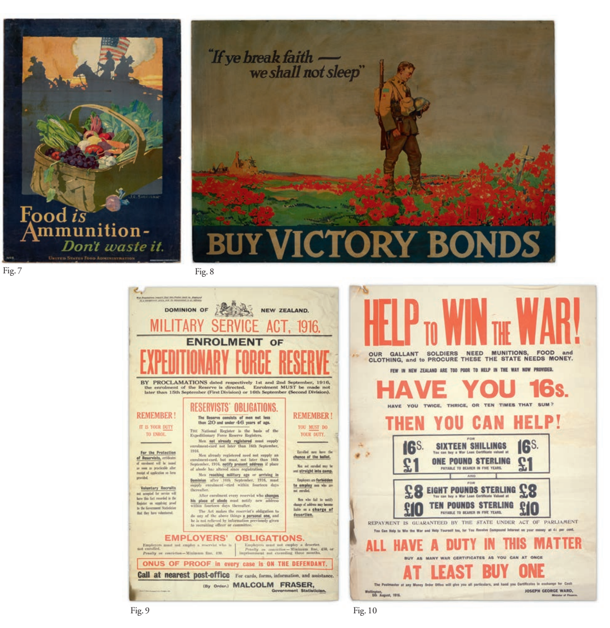
Fig. 7 Poster, 'Food is Ammunition', c . 1918 (by J.E. Sheridan (1880–1948, United States); printed by Heywood Strasser & Voigt Litho. Co.; published by United States Food Administration. Lithograph on paper mounted on strawboard and varnished, 738 × 534 mm. Gift of Department of Defence, 1919. GH016649, Te Papa).

Fig. 8 Poster, 'If ye break faith – we shall not sleep', 1918 (by Frank Lucien Nicolet (c. 1887/89–1944, Canada). Lithograph on paper mounted on board and varnished, 580×873 mm. Gift of Department of Defence, 1919. GH014067, Te Papa). Even though this poster was created for the specific purpose of raising money at the end of the war, the quote from the famous and enduring war poem by Canadian John McCrae (1872–1918) and the image of fields of red poppies would have resonated greatly with viewers in the 1920s (Poppy Day began in New Zealand in 1922).