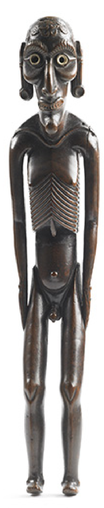
Fig. 22 Moai kavakava (human figure), Rapa Nui (Easter Island), 1800s, wood, bone, shell, obsidian, height 405 mm. Artist unknown. Oldman collection. Gift of the New Zealand government, 1992 (Te Papa OL000342).

The more recent items acquired over this period include four woodcarvings (Te Papa FE016055–58) by Bene Aukara Tuki Pate, an artist based on Rapa Nui. They were brought by Pate to the Tu Fa'atasi exhibition, part of the programme of the New Zealand Festival of the Arts held in Wellington in 1996. Te Papa purchased the pieces from the artist through