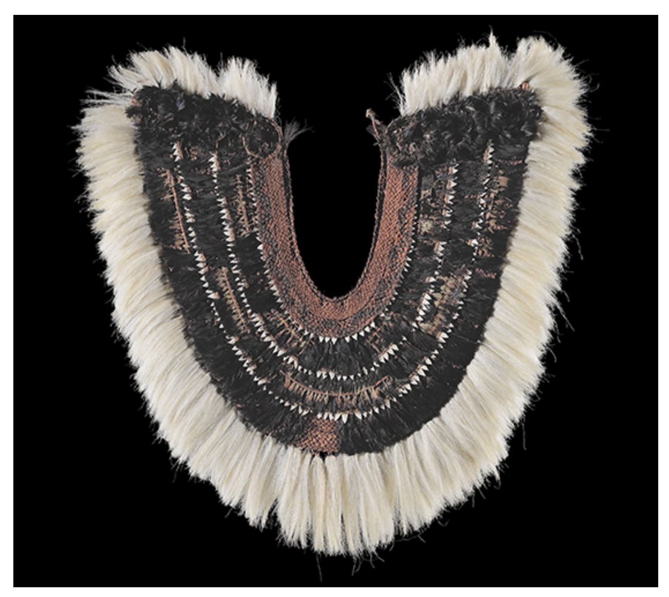
Fig. 6 Taumi (gorget), Society Islands, 1700s, feathers, plant fibre, shark teeth, dog hair, length 690 mm. Artist unknown. Gift of Lord St Oswald, 1912 (Te Papa FE000335).

listed in the first catalogue of Bullock's Museum in 1801. Again, this item was purchased by Charles Winn, who bought it for £12s at the sale of the Bullock's Museum contents in 1819 (Kaeppler 1974; Rose 1993; Davidson 2004: 250).