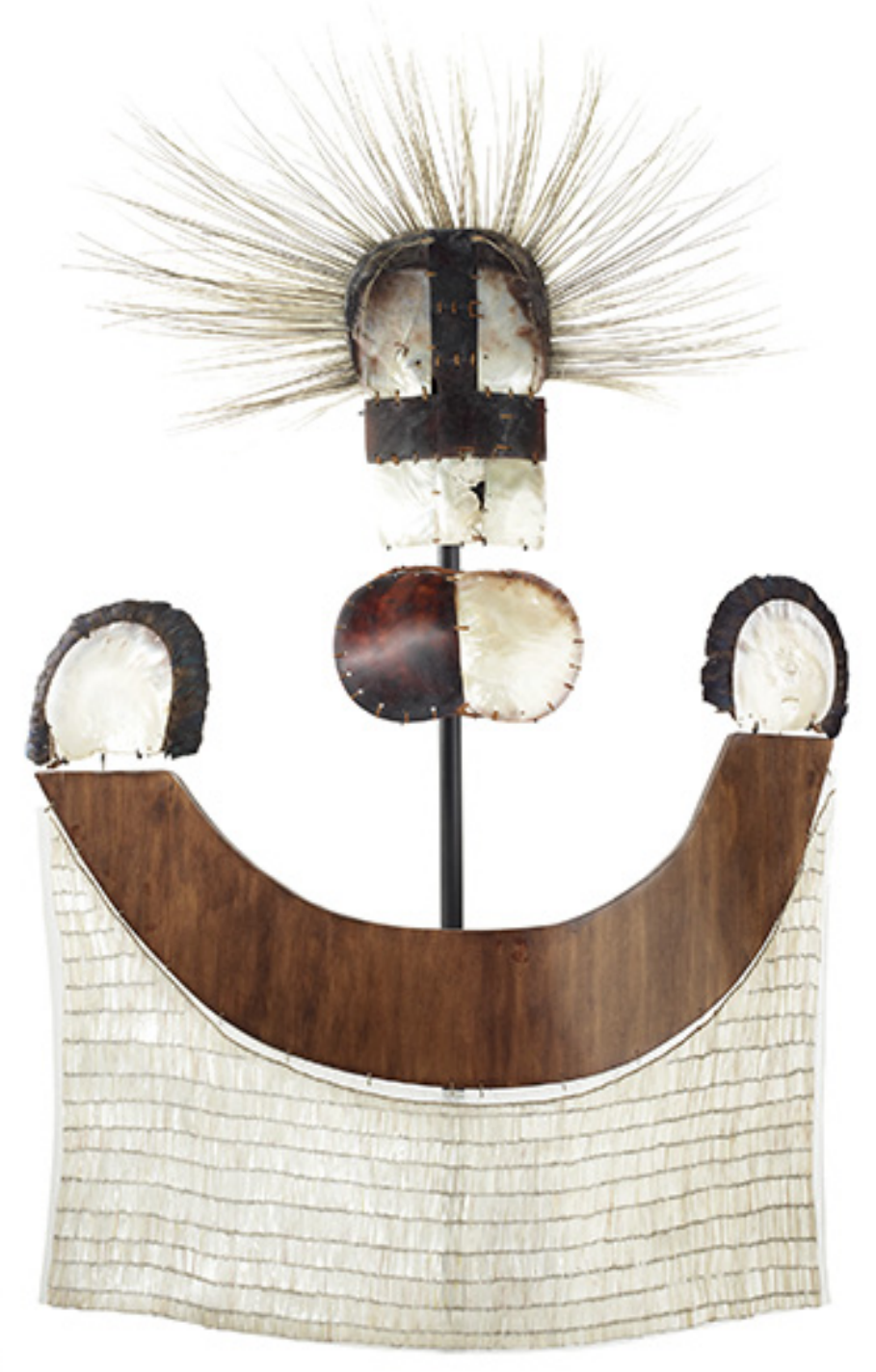
Fig. 5 'Ahu parau (chest apron), Society Islands, 1700s, pearl shell, plant fibre, shell, length 560 mm. Artist unknown. Gift of Lord St Oswald, 1912 (Te Papa Collection FE000336/1).

and their principal lieutenants in Tahiti (Fig. 6). In the eighteenth century, much of the warfare in the region took the form of engagements between large double canoes, and the chiefs could be seen standing on the platforms of the canoes. William Hodges, an artist on James Cook's second voyage, depicted some of these impressive scenes when the expedition visited Tahiti.