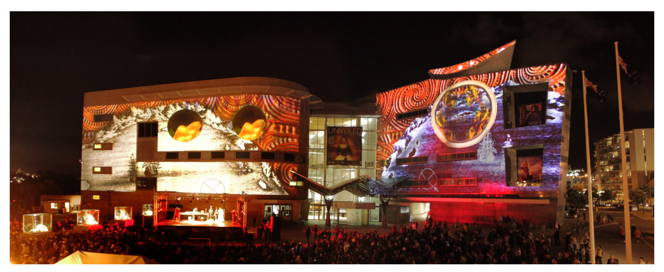
Fig. 13 First Contact (digital artwork), New Zealand, 2012. Artist Michel Tuffery MNZM, New Zealand International Arts Festival 2012 at Te Papa, Wellington, Aotearoa NZ.