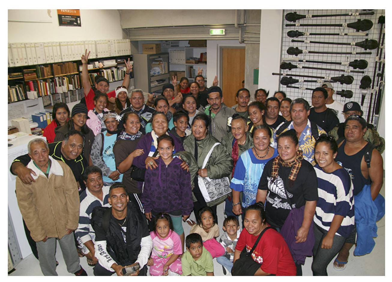
Fig. 32 Group Tauherenui from Parara, Tahiti Nui, during their visit to the Pacific Cultures collections storeroom, Museum of New Zealand Te Papa Tongarewa, 2012.

brought to television and online audiences (via YouTube) stories of the Tahitian mourning costume at Te Papa and the artworks of Michel Tuffery.