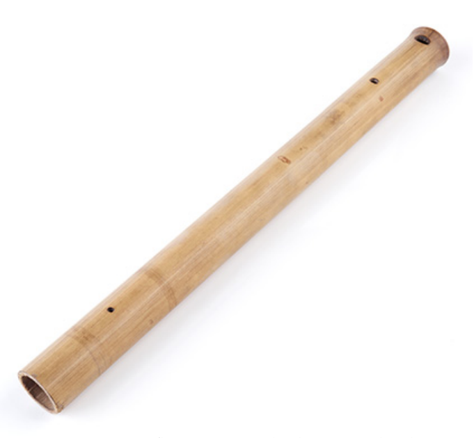
Fig. 7 Vivo (nose flute), Society Islands, c . 1820, bamboo, length 335 mm. Artist unknown. Oldman collection. Gift of the New Zealand government, 1992 (Te Papa OL000452/1).

attached to a short wooden handle with a fibre cord. The blade is made from small sections of boar tusk or bone, each section with a row of very fine, sharp teeth cut into it. A tattooist working on a tattoo dips the ta into a reservoir containing pigment, which is then drawn up into the toothed edge of the blade. Using the light mallet, the tattooist then places the ta on the skin and taps the back of it, perforating the surface of the skin and depositing the pigment beneath it.