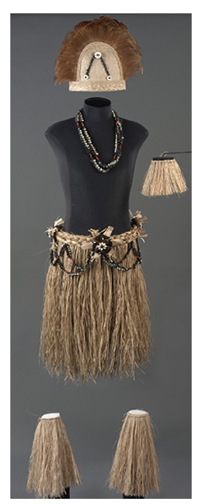
Fig. 24 Hami (male dance costume), Rapa Nui (Easter Island), 2005, banana fibre, mahute fibre, chicken feathers, black shells, glue. Artist Sara Pakarati. Purchased 2005 (Te Papa FE011961/1).

the use of accessories such as ao and rapa (dance paddles) and ua. The Culture Moves! exhibition was the catalyst for Te Papa's Pacific Cultures curators to acquire several complete Pacific Islands dance costumes for the collections.<sup>17</sup> It was also an opportunity to explore questions about the ongoing representation of dance and other forms of intangible cultural heritage in the museum (Māhina-Tuai 2006).