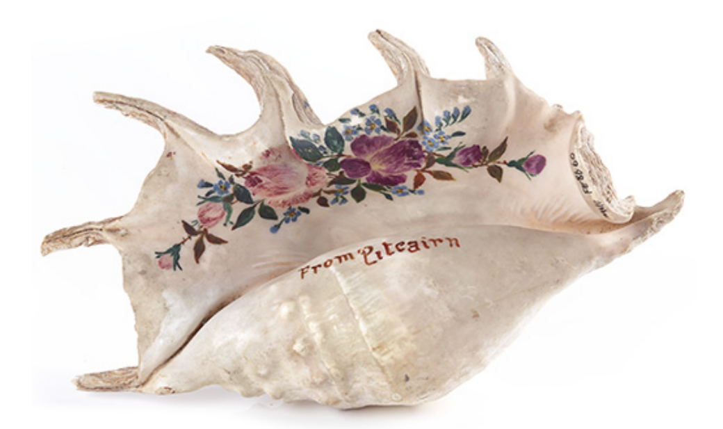
Fig. 19 Painted seashell, Pitcairn Island, 1900s, spider conch shell, 280×175 mm. Artist unknown. Gift of Erskine College, 1986 (Te Papa FE008660).

weaving and barkcloth. They give an indication of what was made on the island over the course of a few decades but are also markers of the ships and people who were passing through the region. Two painted clam shells (Te Papa FE008709/1-2) were collected by Arthur Phillips, a marine engineer of the Port Line, a passenger and cargo shipping company. During the Second World War, he was often part of shipping convoys and voyages between Australia, New Zealand, the American west coast and the United Kingdom. The shells are decorated with hand-painted flowers and foliage, and the words 'Pitcairn Is'. Another example of this kind of souvenir is a painted spider conch shell, originally from the collection of Erskine College in Wellington, New Zealand (Fig. 19). There is also a painted fan collected by a family of immigrants to New Zealand in June 1957. Professor Douglas and Margaret Kidd set out from England aboard the ship MV Rangitane of the New Zealand Shipping Company, and it made a stop at Pitcairn Island en route. In 2003, the fan was presented to Te Papa by their daughter Alison Lloyd Davies.