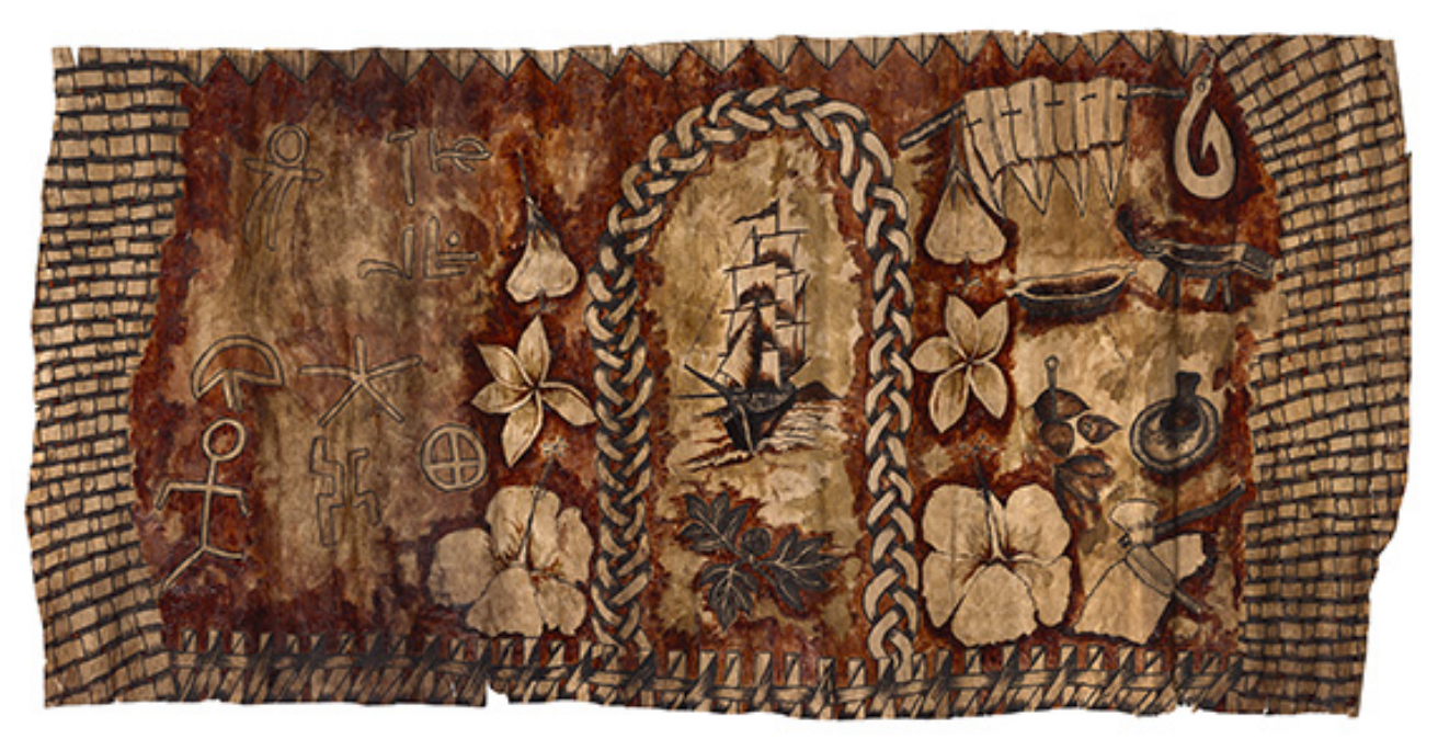
Fig. 20 'Ahu (tapa cloth), Woven through time , Pitcairn Island, 2011, bark cloth, dyes, 107×150 mm. Artist Meralda Warren. Purchased 2011 (Te Papa FE012634).