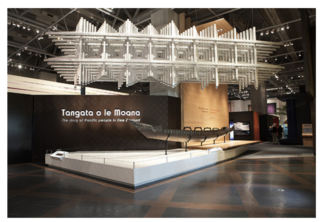
Fig. 28 Entrance to Tangata o le Moana exhibition, Museum of New Zealand Te Papa Tongarewa, 2007.