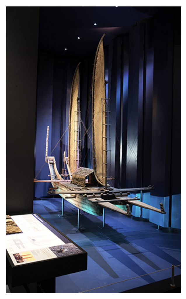
Fig. 29 Model tipaerua (double-hulled sailing canoe), Society Islands, in the Tangata o le Moana exhibition, Museum of New Zealand Te Papa Tongarewa, 2007. Artists Izzat Design Ltd, Wellington (photo: Michael Hall; Te Papa MA_I.115664).

modern navigation devices, instead relying on the sailing techniques of their East Polynesian ancestors. In 1991, Hekenukumai Busby built Te Aurere . This waka hourua has made a series of epic voyages, retracing the paths of Kupe and other Pacific navigators, and voyaging along two sides of the Polynesian Triangle marking the outermost reaches of eastern Pacific settlement – New Zealand, Hawai'i and Rapa Nui. At the time of writing, Te Aurere and another waka, Ngahiraka Mai Tawhiti , were on the final stage of a voyage to complete the triangle by sailing from New Zealand to Rapa Nui and back again.