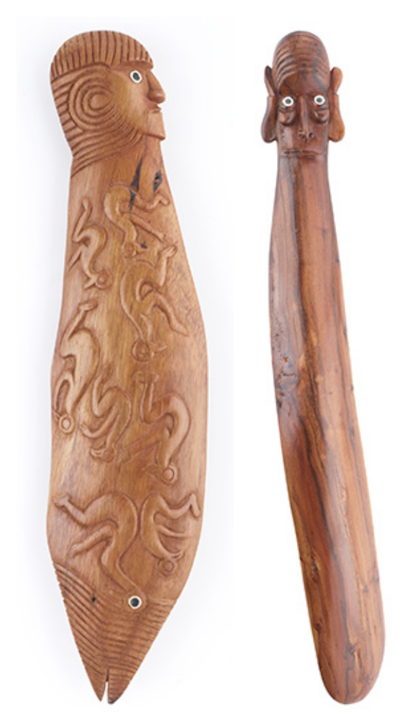
Fig. 23 Left: Ika Tangata (Fish Man ), Rapa Nui (Easter Island), 1996, wood, length 410 mm. Artist Bene Pate. Purchased 1996 (Te Papa FE010657). Right: paoa (hand club), Rapa Nui (Easter Island), 1996, wood, length 500 mm. Artist Bene Pate. Purchased 1996 (Te Papa FE010656).

the exhibition organisers, Siva Lava Productions, and hosted him briefly at the museum. Pate's works are inspired by older, well-established carving forms such as the moai kavakava mentioned above, and feature what are now distinctive elements of indigenous style and imagery (Fig. 23). However, they also incorporate his own artistic innovations and interpretations, in the sense that there has always been variation in the seemingly homogenous style of Rapa Nui carved works (Heyerdahl 1979).