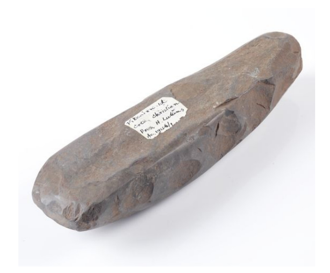
Fig. 18 Adze blade, Pitcairn Island, date unknown, basalt, length 200 mm. Maker unknown. Gift of H. Lukins 1946 (Te Papa FE006287).

The Pitcairn Islands consist of Pitcairn Island, Henderson Island (a bird sanctuary), and Ducie and Oeno islands (both low-lying coral atolls). They are located between the Society Islands and Rapa Nui (Easter Island). In English maritime history, they are most famous as the home of the mutineers of the Royal Navy ship HMS Bounty , who settled on Pitcairn in 1790. The mutineers were joined by six Ma'ohi men, 12 women and a baby girl. Today, the descendants of the mutineers still live on the island. Politically, the islands are administered by a governor who is the British High Commissioner to New Zealand.