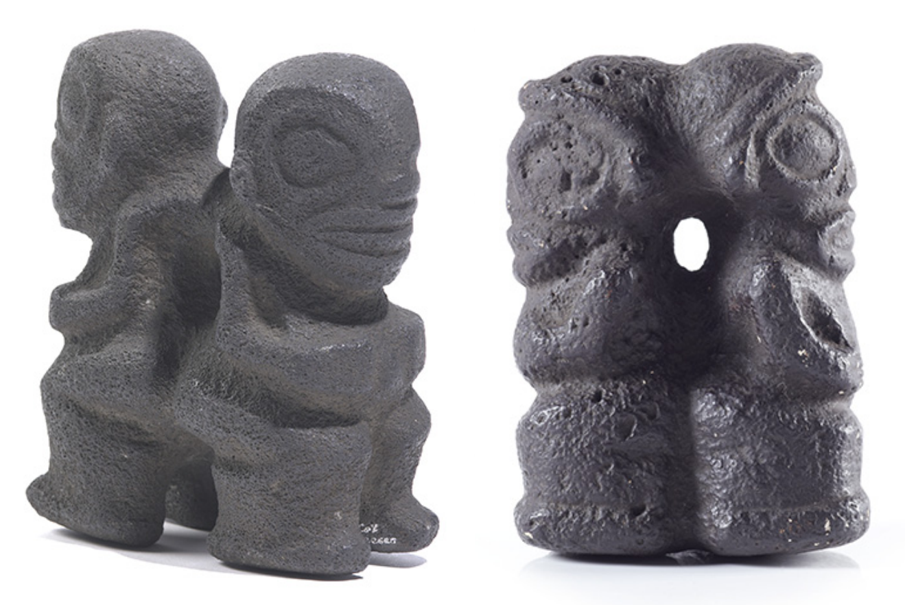
Fig. 15 Left: tiki ke'a (carved human form), Marquesas Islands, 1800s, stone, height 130 mm. Artist unknown. Oldman collection. Gift of the New Zealand government, 1992 (Te Papa OL000185). Right: tiki ke'a (carved human form), Marquesas Islands, c . 1885, casting plaster, height 150 mm. Artist unknown (Te Papa FE000302/3).

items end up in the Oldman collection and subsequently at the Dominion Museum.