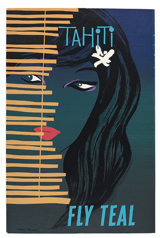
Fig. 27 Poster, 'Tahiti', New Zealand, 1950s, paper, ink, 970×630 mm. Artist Arthur Thompson. Purchased 2001 (Te Papa GH009292).

significance is its value as a painting connected with Cook's voyages, but it also hold an important place in the history of representation of Pacific peoples – indeed, the portrait may have set the conventions for images made in the region ever since (Christie's 2008: 12). Poetua is the perfect accompaniment for another large-scale portrait by Webber of James Cook, which is also at Te Papa. Together, they are key portraits in the history of art and cultural encounter in the Pacific.