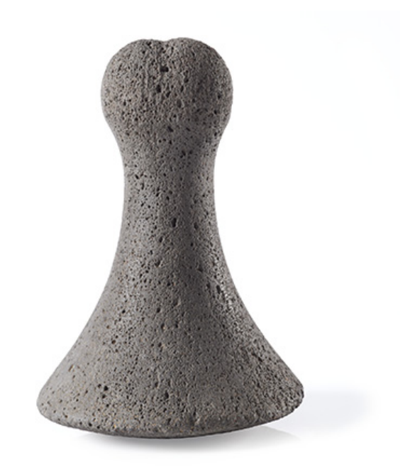
Fig. 4 Penu (food pounder), Society Islands, c . 1800s, stone, height 195 mm. Artist unknown. Gift of F. Gentry, 1947 (Te Papa FE008557).

Several items in the Lord St Oswald accession are from the Society Islands and are associated with Cook's voyages. They include a mask and 'ahu parau (chest apron) from an eighteenth-century mourning costume used by the arioi, a