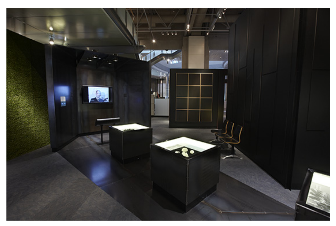
Fig. 30 View of the Radioactive Pacific segment of Slice of Heaven: 20th century Aotearoa exhibition, Museum of New Zealand Te Papa Tongarewa, 2010 (photo: Michael Hall; Te Papa MA_I.210070).

involvement in museum events, help provide context and create meanings for the objects. Our observation is that Te Papa's levels of interaction with East Polynesian communities have increased in the last 20 years, as have the sites and products that facilitate those interactions.