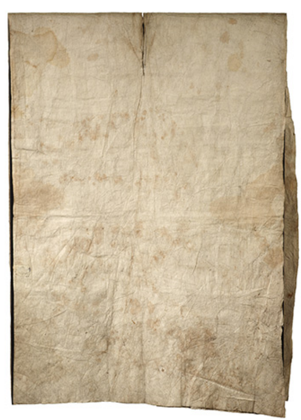
Fig. 9 Tiputa (poncho), Society Islands, 1700s, bark cloth, length 1170mm. Artist unknown. Gift of the Wellcome Collection, 1952 (Te Papa FE004054).

It is possible that the tattooing tools were collected during the Cook's voyages. They were in the possession of Queen Victoria and given to the Imperial Institute in London, England, by Edward VII. We highlight the ta because in the twenty-first century tattooing has become a most visible part of contemporary Tahitian and other Polynesian cultures including Māori. The indigenous tool forms and how they are used are a point of similarity and shared culture for contemporary practitioners and tattoo enthusiasts from different ethnic origins.