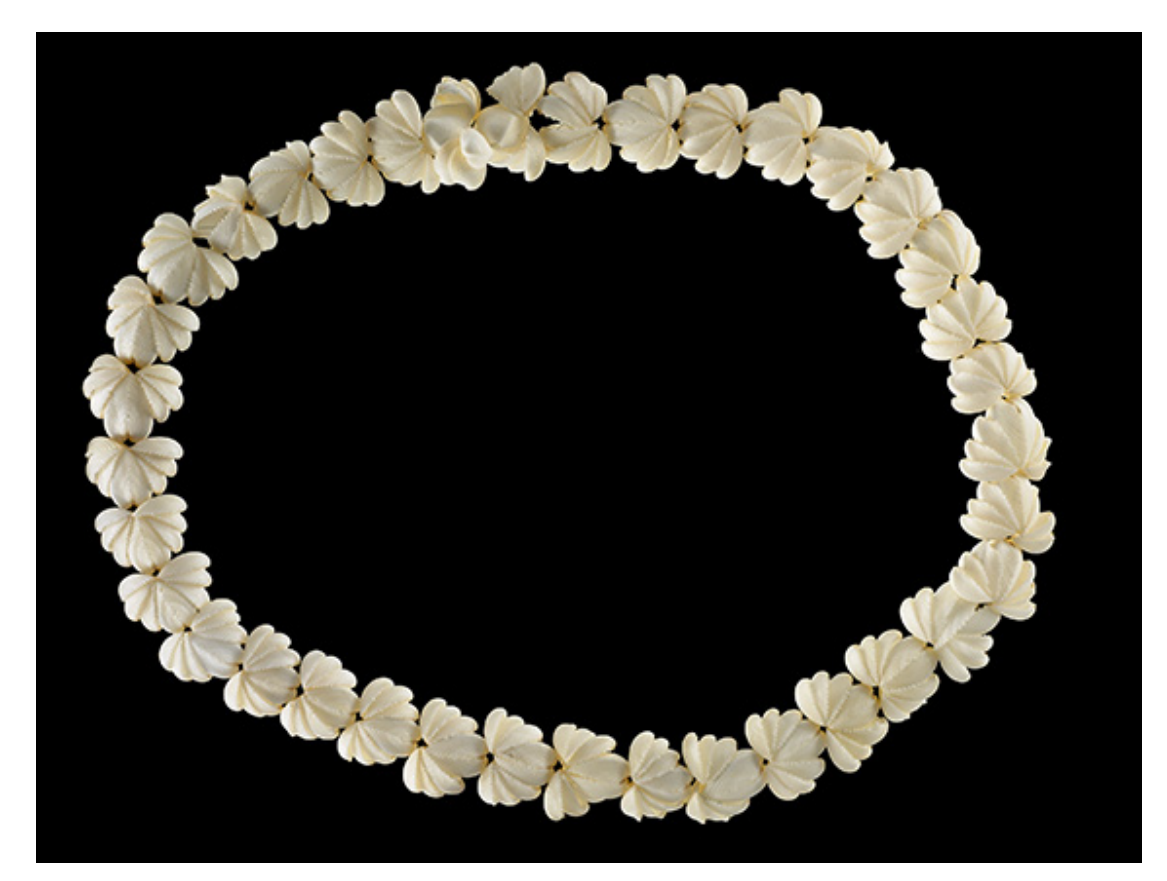
Fig. 10 Hei (shell necklace), Society Islands, 1960s, seashell, fibre, length 1050 mm. Artist unknown. Gift of Anton Coppens, 2009 (Te Papa FE012425).

information across national borders that may or may not include the place of origin.