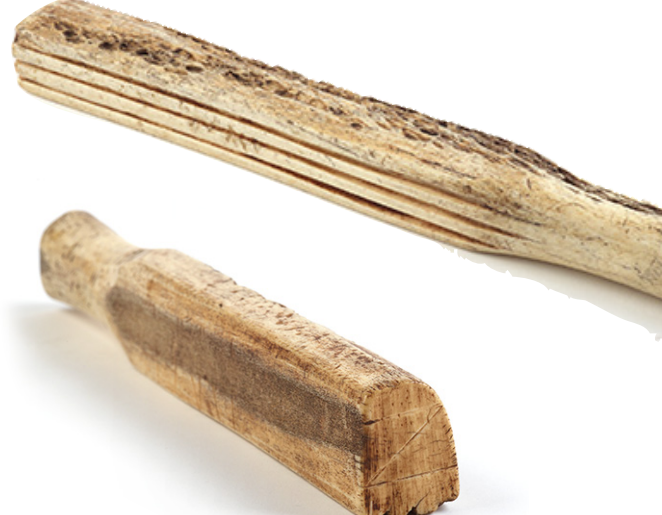
Fig. 21 Eei (tapa beater), Pitcairn Island, 1800s, whale bone, length 358 mm. Artist unknown. Collection development loan, 1964 (Te Papa TMP012489).

and of petroglyphs left on Pitcairn Island by earlier inhabitants, and at the centre is the ship Bounty . Other elements depicted include a fishhook, an una (coconut grater), an ometea (wooden dish), and a stick for husking coconut, a hatchet and an e'e (tapa beater). Te Papa also acquired examples of contemporary woven baskets. These were made by Meralda's mother, Mavis Warren, who had been weaving for 60 years. The selection includes several