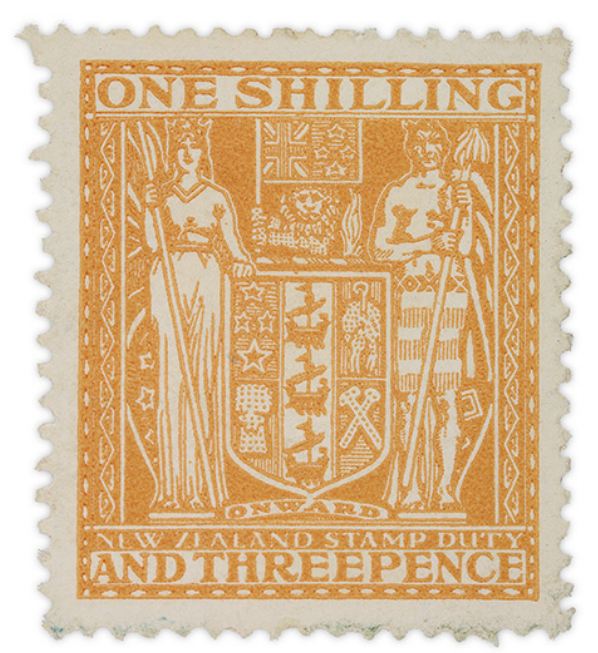
Fig. 27 Type fiscal stamp, 'Arms', 1s 3d, 1931. Designer H. Linley Richardson (Te Papa PH.000763).

'anti-tuberculosis' cross, and appropriate inscriptions complete the design. The whole is just twice the size as it need be, and very badly surface printed. It is a little worse than the worst advertising label we have seen, and would disgrace the least self-respecting quack. ("World's worst" 1931).