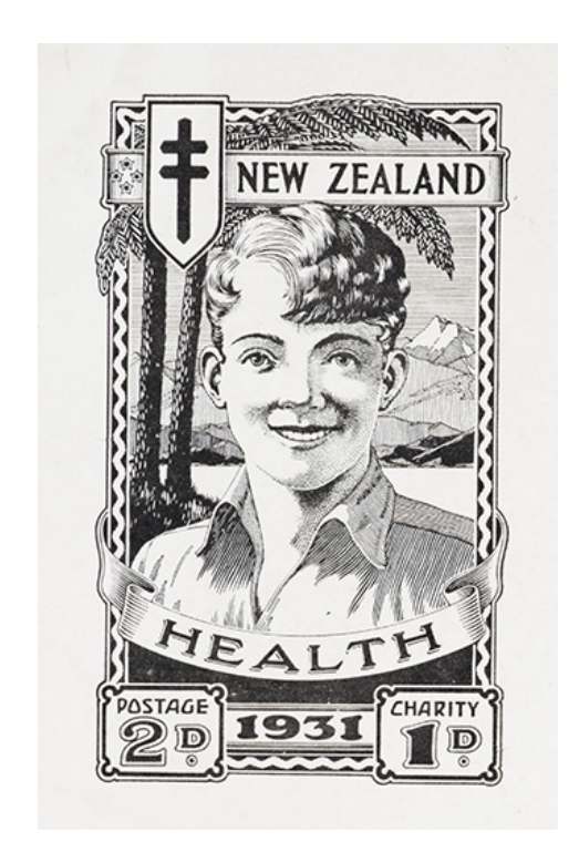
Left : Fig. 12 'Smiling Boy', 1d, 1931, photographic print of artist's drawing supplied by Government Printing Office. Original drawing c. 1929–30, designer Leonard Mitchell (New Zealand Post Museum collection, Te Papa PH.000711).