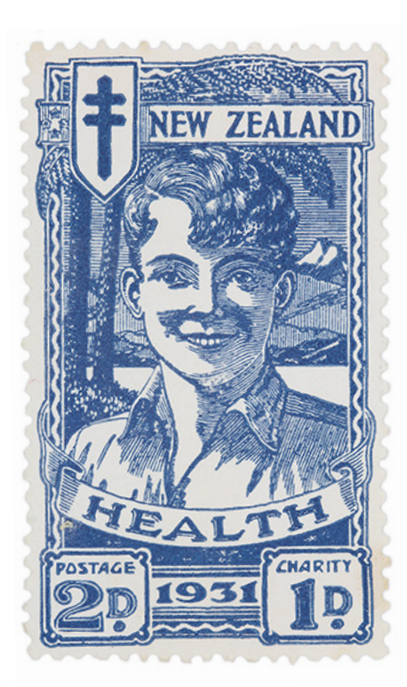
Left: Fig. 1 Charity/Health stamp, 'Smiling Boy', 1d + 1d, 1931. Designer Leonard Cornwall Mitchell (Te Papa PH.000311). Right: Fig. 2 Charity/Health stamp, 'Smiling Boy', 2d + 1d, 1931. Designer Leonard Cornwall Mitchell (Te Papa PH.000312).

least, affordable. Unlike similar charity stamps from Belgium and Switzerland, a complete New Zealand collection of Health stamps could be obtained for 'somewhere in the vicinity of $7.00' (Miller 1942: 86).