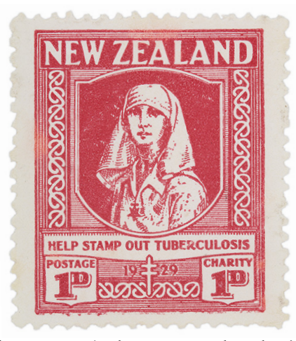
Fig. 6 Charity stamp, 'Help stamp out tuberculosis', 1d + 1d, 1929. Designer Stanley Davis (Te Papa PH.000309).

In common with the George V definitive issues of 1915 and 1926, and the 'New Zealand and South Seas Exhibition' set, the design attractively incorporates decorative borders