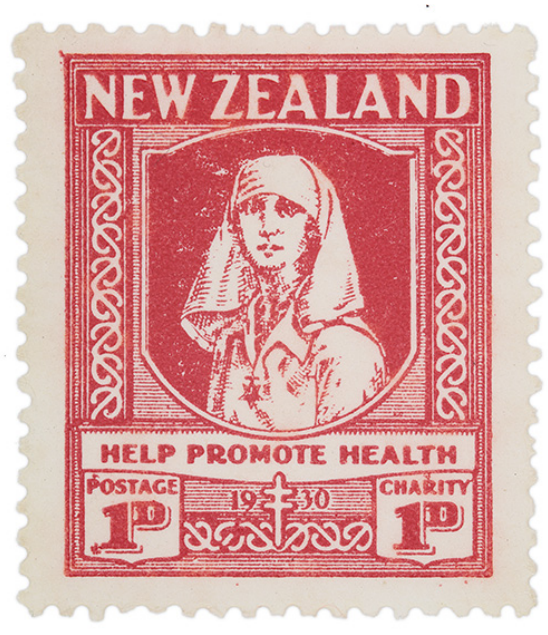
Fig. 7 Charity stamp, 'Help promote health', 1d + 1d, 1930. Designer Stanley Davis (Te Papa PH.000310).

It was precisely this attempt at consciousness raising that explains an innovation accompanying the 1930 stamp: the official promotional poster, commissioned from the Government Printer and prominently displayed in post offices and other government buildings during the limited