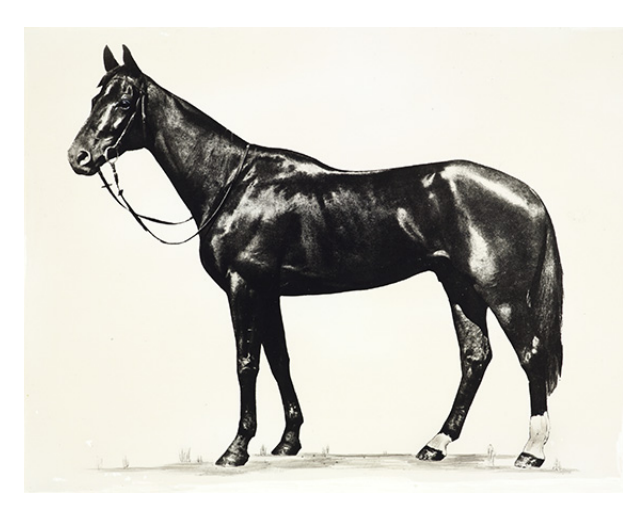
Fig. 25 Phar Lap, 1920s.

on the depth of the Great Depression ('Health camp, minister's appeal' 1931).