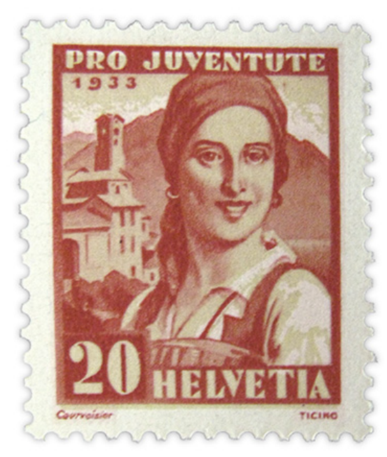
Fig. 28 Stamp, 'Pro Juventute', Switzerland, 20 centimes, 1933. Designer Jules Courvoisier (author's collection).

The invective of the main article is more than a little reminiscent of Charles Dickens's infamous critique of the