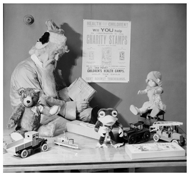
Fig. 26 Publicity photograph for Health stamps, 1931.

In Wellington, a publicity committee was formed to promote the use 'of Christmas seals or charity stamps'; its members included Myers and Paterson ('Health camps for delicate children' 1931). A 'large sale of stamps was expected' for the Christmas season by the ladies' auxiliary of