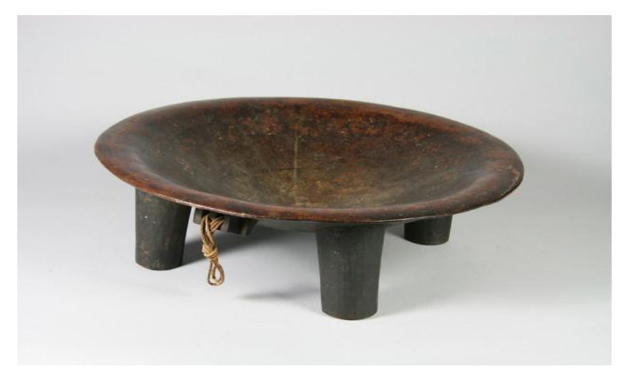
Kumete (kava bowl), 1800s, Tonga, maker unknown. Purchased 1994 with New Zealand Lottery Grants Board funds. Te Papa (FE010327)

Find out more about the Tongan concept of koloa (wealth) and discover more about these treasures, and their significance in different contexts and environments. This resource from the Pasifika Education Centre could be a good start.