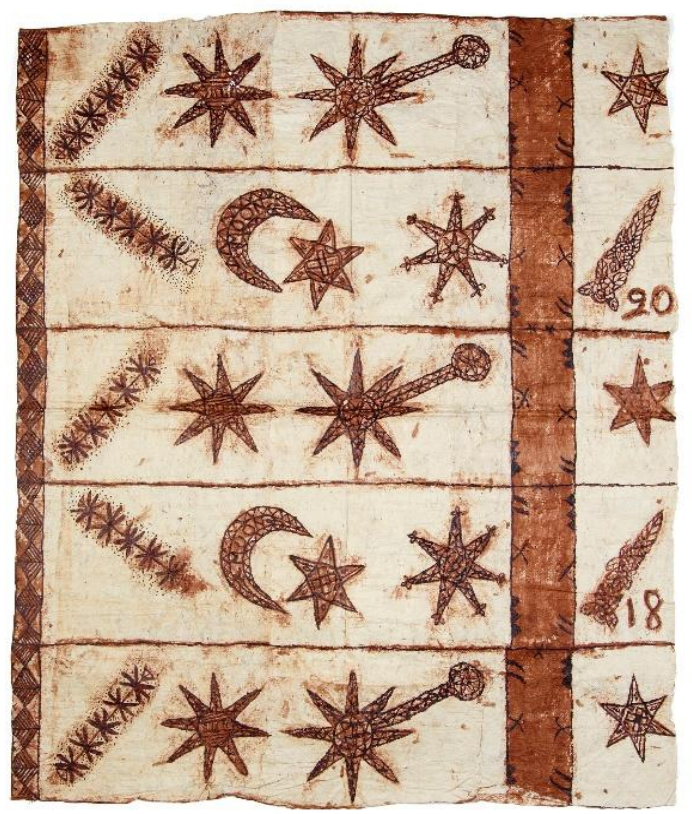
Ngatū (tapa cloth). Maker unknown. Purchased 2009. Te Papa (FE012487)

N.B. Save these files to your computer before trying to open.