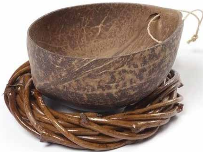
Fig. 4 Apu (coconut shell cup), 2004, Hawai'i, by Delos Reyes Anthony. Gift of Ka hale mua o Maui loa, 2004. Te Papa (FE012712/1)