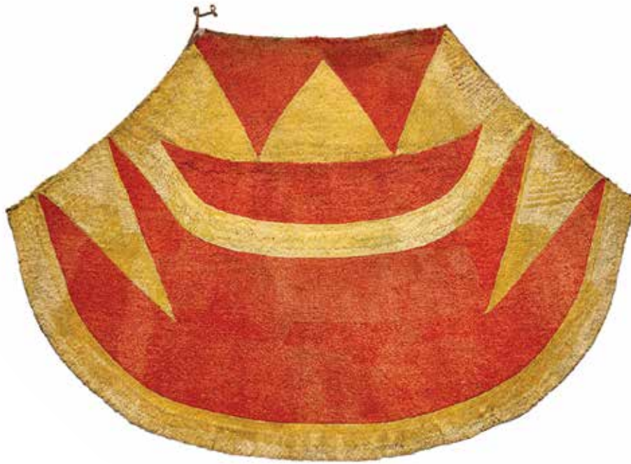
Fig. 1 'ahu 'ula (feathered cloak), 1700s, Hawai'i, maker unknown. Gift of Lord St Oswald, 1912. Te Papa (FE000327)

'ula and mahiole for their return to Hawai'i. It documents perspectives from staff and community members to shed light on aspects of the museology relating to the treatment and movement of cultural treasures. The 'ahu 'ula and mahiole were a catalyst for the investigation and recovery of knowledge, and the enacting of cultural protocols and renewal of cultural connections. The first two accounts are from textile conservation and collection management staff who deinstalled and stabilised the 'ahu 'ula and mahiole in preparation for travel to Hawai'i. They are followed by the reflections of Te Papa's Kaumātua (Māori elder) and Kaihautū (Māori leader), who oversaw the negotiations and indigenous ceremonial protocols related to the loan and handover process.