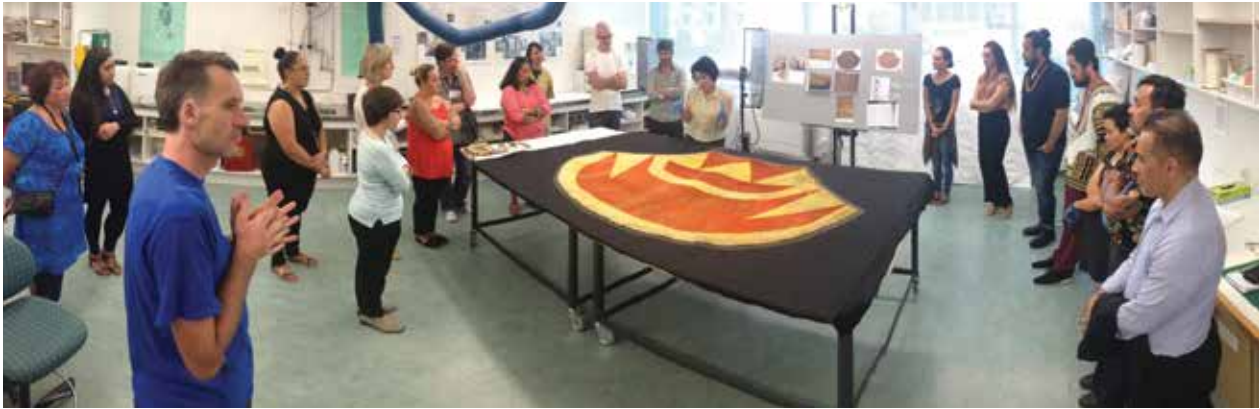
Fig. 5 'The 'ahu 'ula of Kalani'ōpu'u: stories of a sacred cloak' seminar series at Te Papa in association with the Hawai'i Cultural Centre, Wellington (24 February to 2 March 2016).

As a curator of Pacific cultures, the most significant shift I have witnessed since I joined Te Papa in 1992 has been in how we talk about the 'ahu 'ula – from its value as an ethnological specimen collected on voyages of European exploration, to an artefact with the potential to strengthen the connections of contemporary Hawaiian people to their history and cultural identities; from Cook's cloak to Kalani'ōpu'u's cloak, and from feather cloak to 'ahu 'ula. The catalogue of photographs of the 'ahu 'ula highlight changes in interpretation over time: photographs taken in 1959 are catalogued as 'Hawaiian Feather Cloak – Captain Cook relic'; in 1977 as 'Captain Cook's Hawaiian feather cloak'; in 1984 as 'Captain Cook's Hawaiian cloak'; and in 2015 as "'ahu 'ula (feathered cloak); 1700s; Hawaiian'. 9