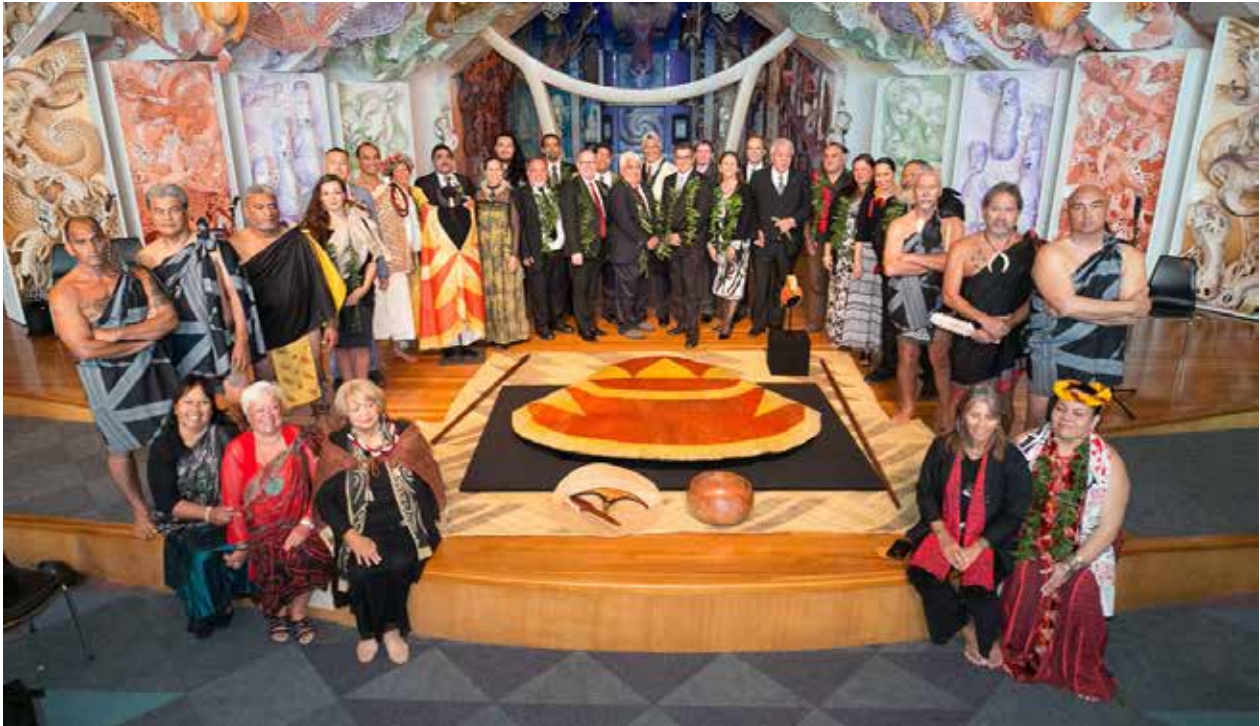
Fig. 7 Participants at the ceremony marking the return of the mahiole and 'ahu 'ula of Kalani'ōpu'u, from Te Papa to the Bishop Museum in March 2016. Te Papa, Cable Street, Wellington.

The conduit of humanity's collective ancestry opened to all, and in those moments amid the sacred space at Te Papa's marae we became one.