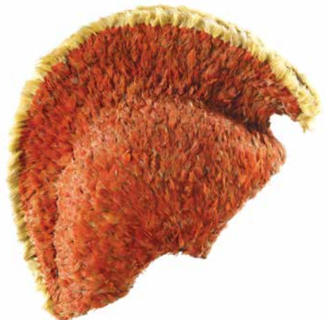
Fig. 2 Mahiole (feathered helmet), 1700s, Hawai'i, maker unknown. Gift of Lord St Oswald, 1912. Te Papa (FE000328/2)

The epilogue and final reflection is from members of the Hawai'i Cultural Centre in Wellington. As residents of Wellington, they regularly visited the 'ahu 'ula and mahiole at Te Papa. They advised staff and performed cultural protocols during the deinstallation, and shared cultural knowledge that informed the conservation treatment. These accounts and this article as a whole are a companion to another paper in this edition of Tubinga , authored by Noelle Kahanu (p. 24).