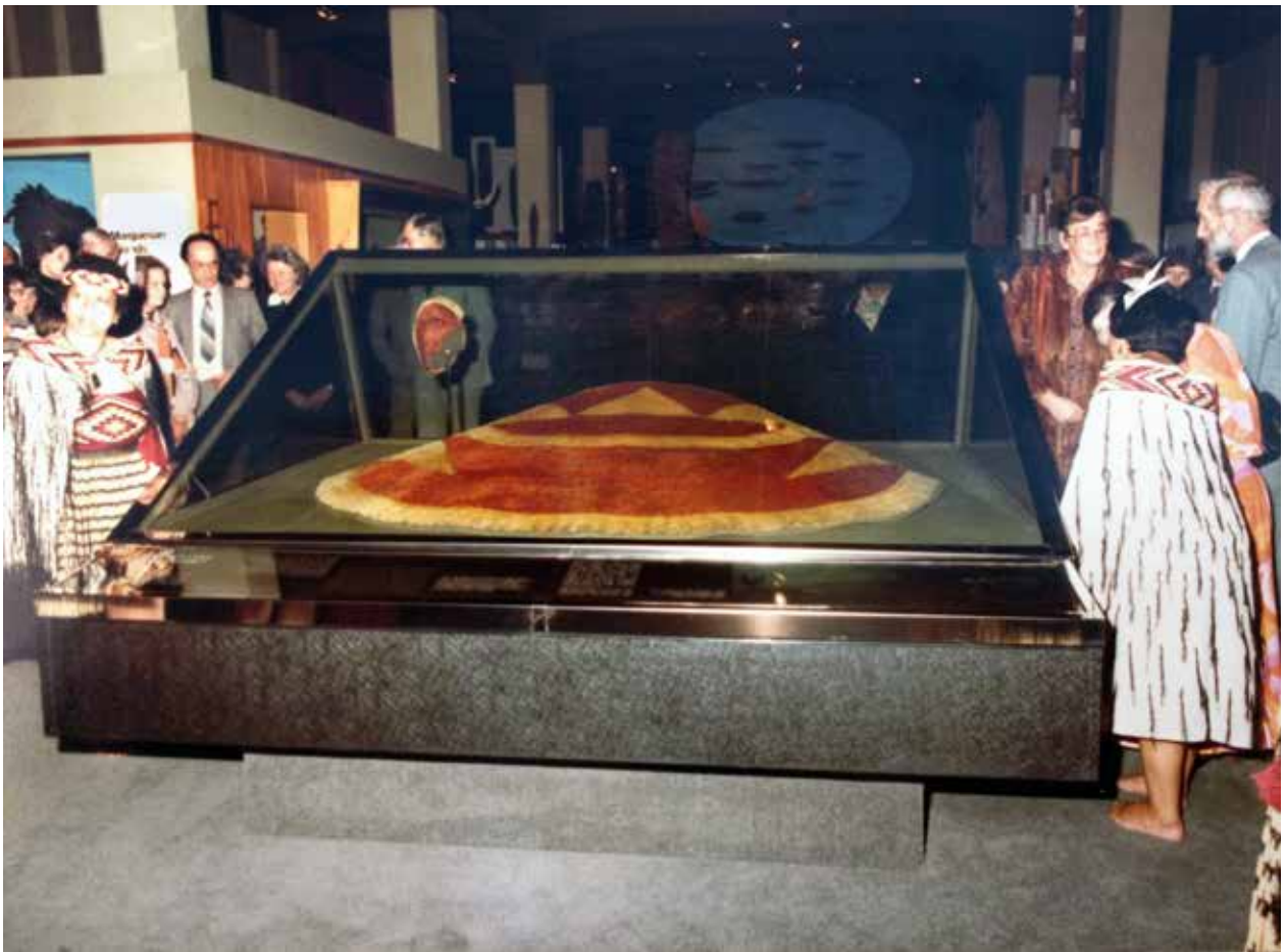
Fig. 3 Pacific Hall exhibition, 1984, National Museum, Buckle Street, Wellington.