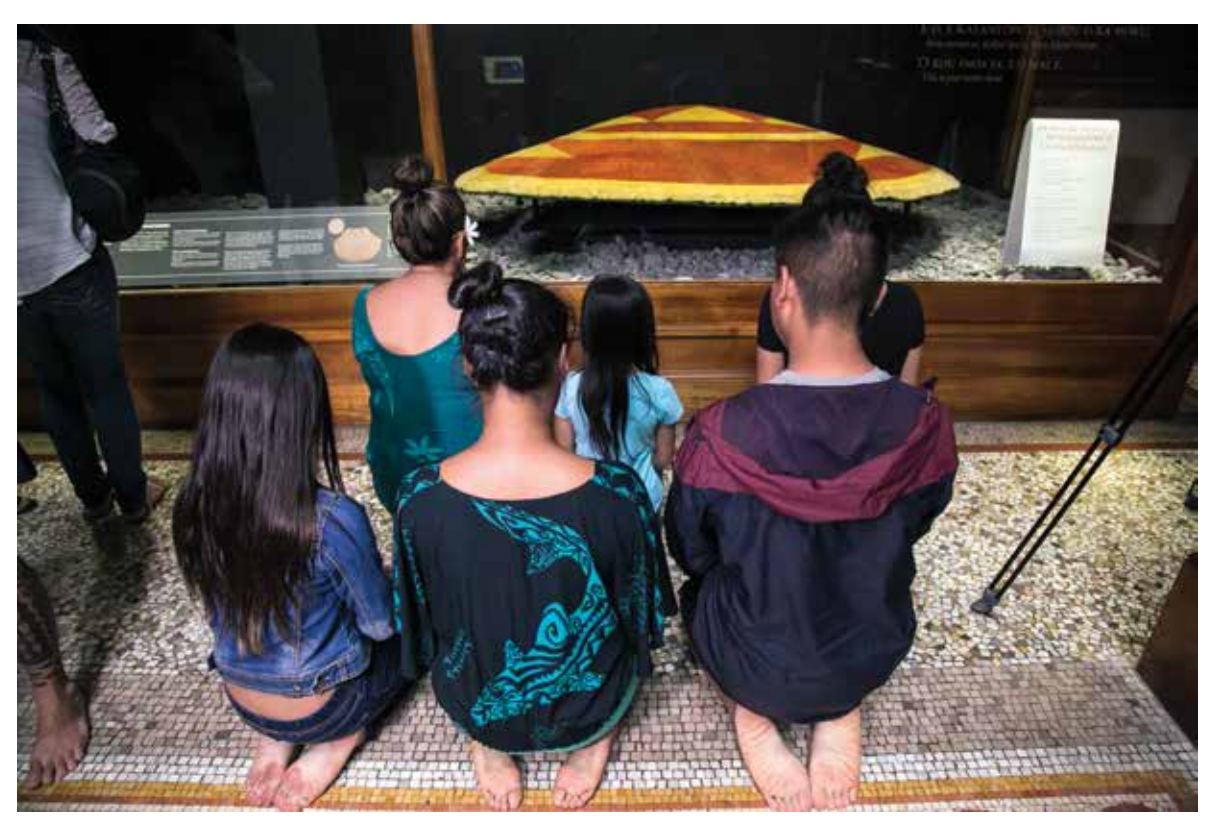
Fig. 6 A group pays their respects before Kalani'ōpu'u's 'ahu 'ula and mahiole at the public unveiling, 19 March 2016.

kind responded, his own agency, his own desire to return helping to pave his way home.