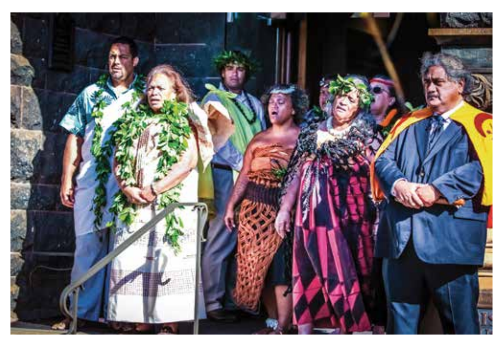
Fig. 5 Honoring Kalani'ōpu'u's 'ahu 'ula and mahiole at the entrance of Hawaiian Hall, Bishop Museum, 17 March 2016.

first contact, if you will. That it comes from that very important point in our history that forever changed Hawai'i. (Pers. comm., 2016)