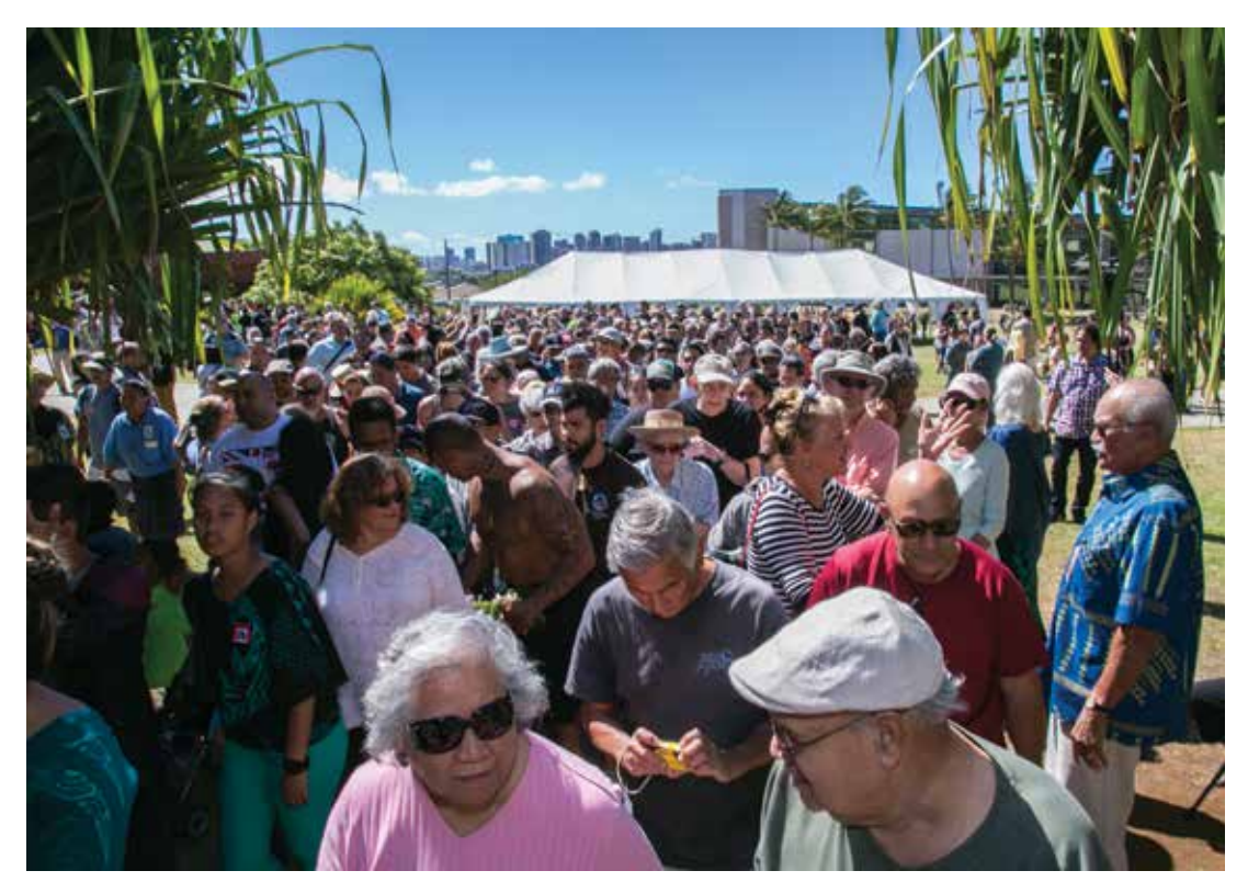
Fig. 2 Hundreds awaited entry into the He Nae Ākea: Bound Together exhibition at its public unveiling at Bishop Museum, 19 March 2016.