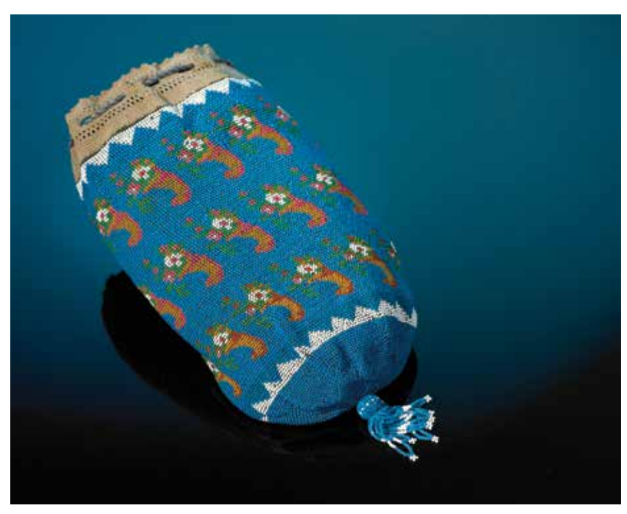
Fig. 2 Purse, c. 1860–80, glass beads, cotton. Maker unknown. Gift of the Hager family, 2007 (CC BY-NC-ND licence; Te Papa GH015606).

displayed in an exhibition on uniformity, as an example of religious dress (Fig. 3). Even though the exhibition concept did not require it, the curators decided to include Rex's refugee story as part of the exhibition label accompanying the gown, 'because the story's so great and it's respectful, we did two jobs – we used it as a religious dress and as a refugee story' (Gibson 2015). This approach is, of course, effective only if all those historical significances are noted in the object record. Issues of representation – such as exhibition concept development, acquisition cataloguing and exhibition labels – have a direct impact on the 'refugee presence' in institutional memory.