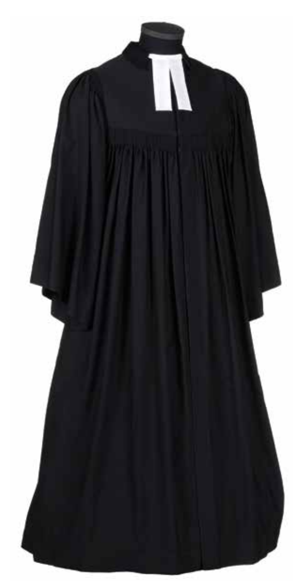
Fig. 3 Minister's gown, Berlin, c. 1938, wool, silk, metal. Otto Weber. Gift of the Reverend Denzil J. Brown, 2006 (CC BY-NC-ND licence; Te Papa GH015487).

its collection materials 'must support research into New Zealand and New Zealanders', be of 'national documentary significance' and be accessible to the public. Refugee materials are given high collection priority by the library, whose acquisitions policy is deeply conscious of the great movement of refugees and displaced people from Europe between the late 1930s and early 1950s. According to curatorial services leader John Sullivan (2015), the library considered the Jewish refugee movement a significant part of that phenomenon and 'have always been "on the lookout" ... for material that would sort of enhance that part of