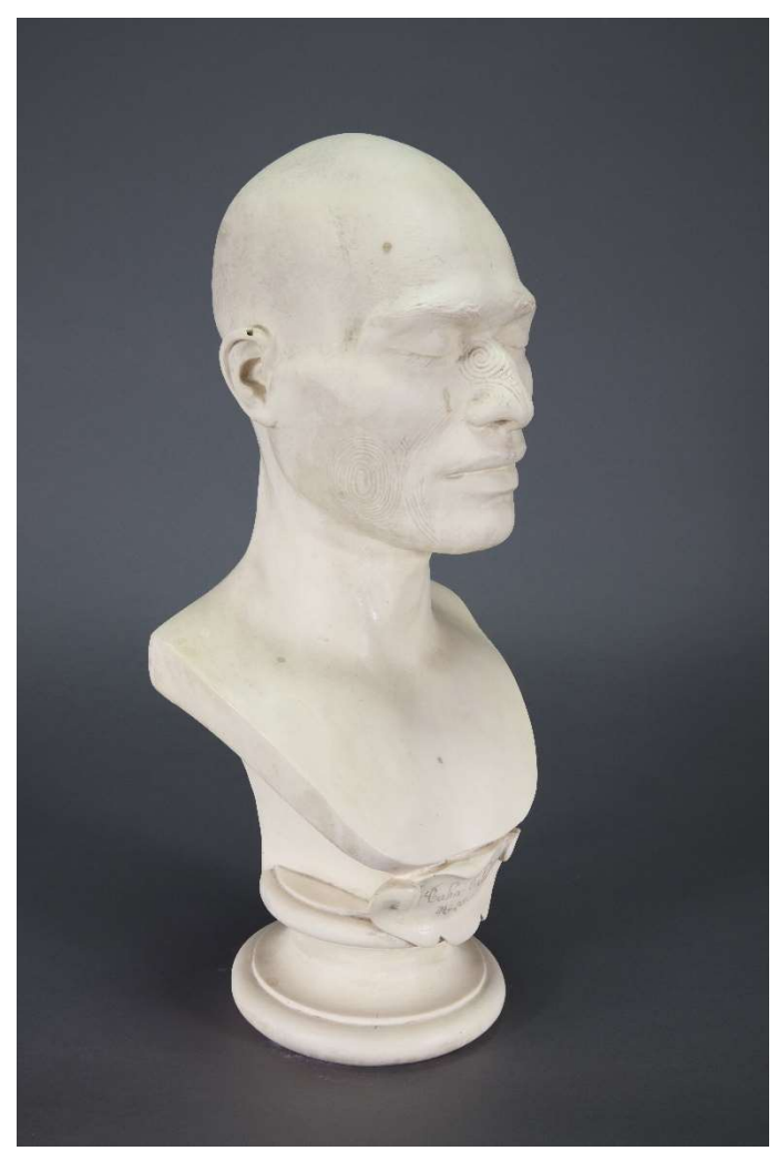
Figure 4 Copy of the cast of Taha Tahala showing face forward and right profile, Gottingen University collection