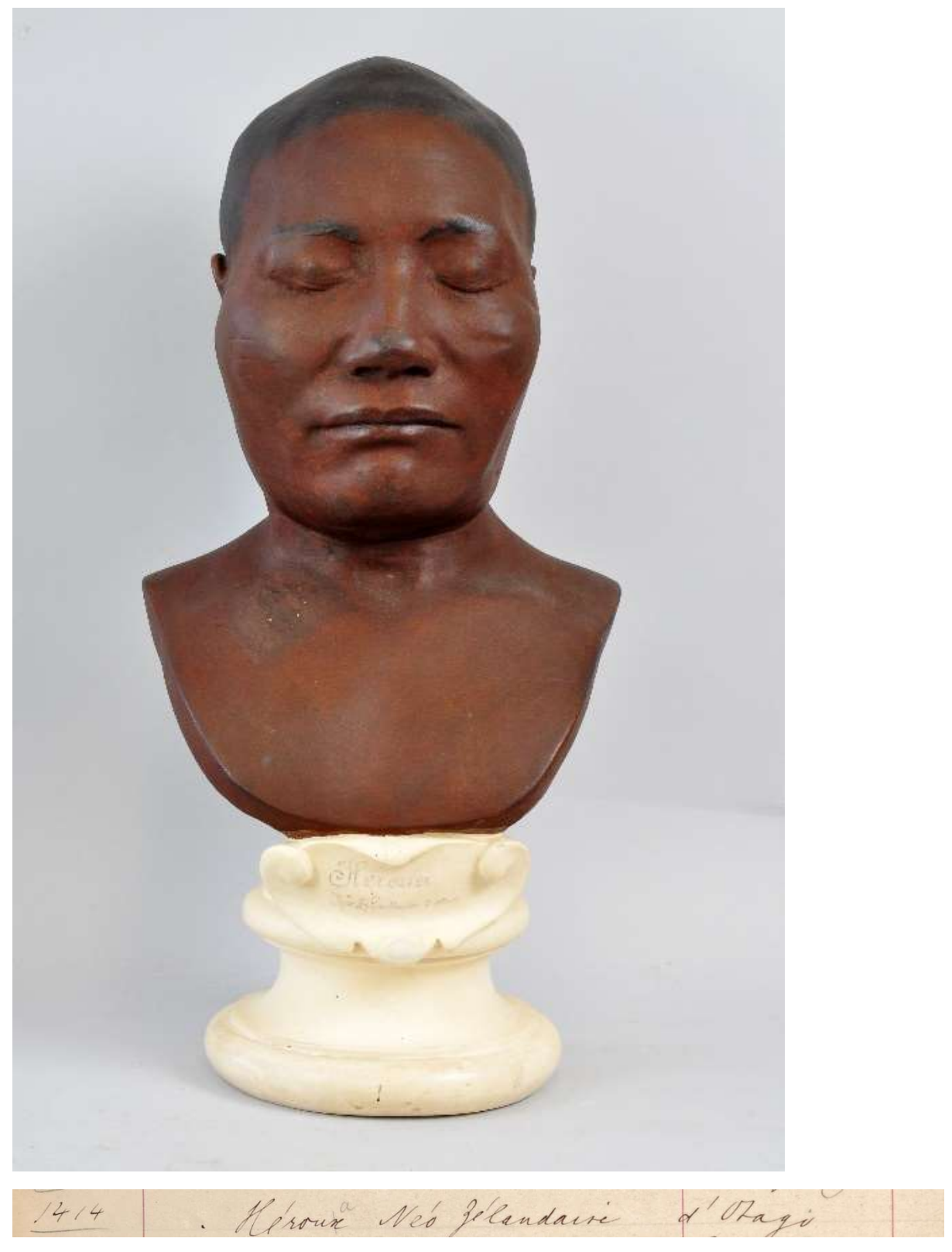
Figure 1 Grassi Museum accession register