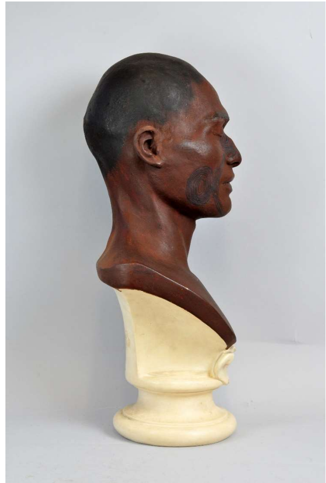
Figure 2 Plaste bust of 'Taha Tahala' showing face forward and right profile, Grassi Museum collection