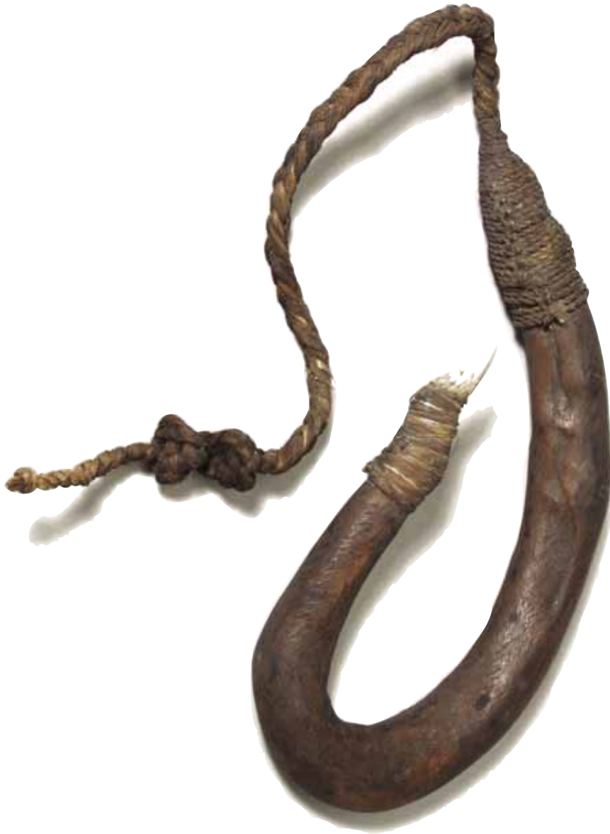
Fig. 1 Māori fishhook, by March 1770, wood, harakeke, kiekie, bone, 180 mm long (excluding cord). Maker unknown. Acquired on the first of James Cook's famous voyages to the Pacific, in HMS Endeavour (1768–71); given by Joseph Banks to Christ Church, Oxford, by 16 January 1773; transferred on loan from Christ Church to the University Museum, Oxford, in 1860; 'incorporated' into the Pitt Rivers Collection in 1887 (Christ Church collection, Pitt Rivers Museum, University of Oxford: 1887.1.379).